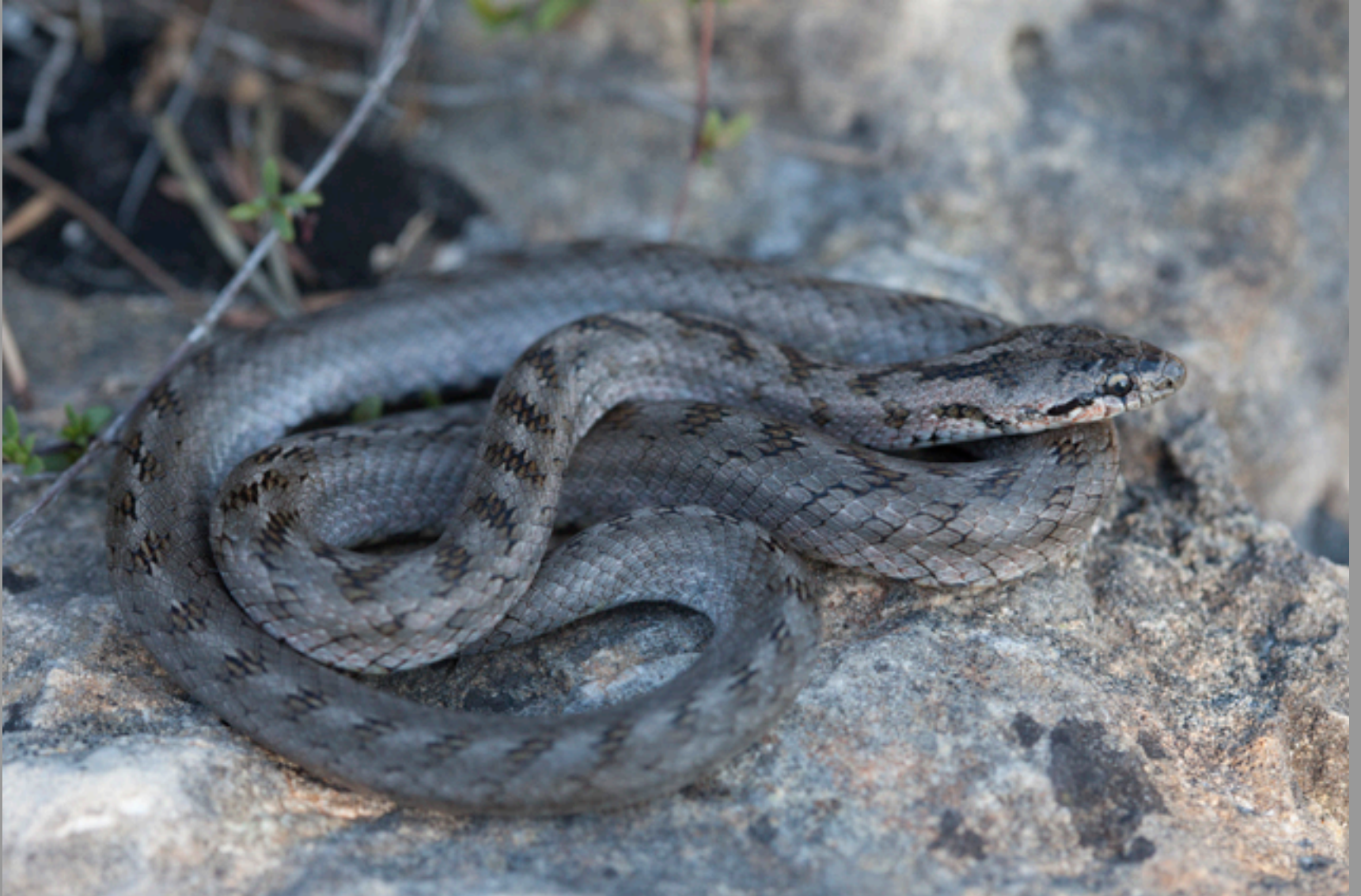
Coronella girondica ... dead

on the road. Same thing for snakes : Malpolon monspessulanus , Coronella girondica and Rhinechis scalaris KOR... Later in the night, on the way to Millau, I found another Coronella girondica KOR.