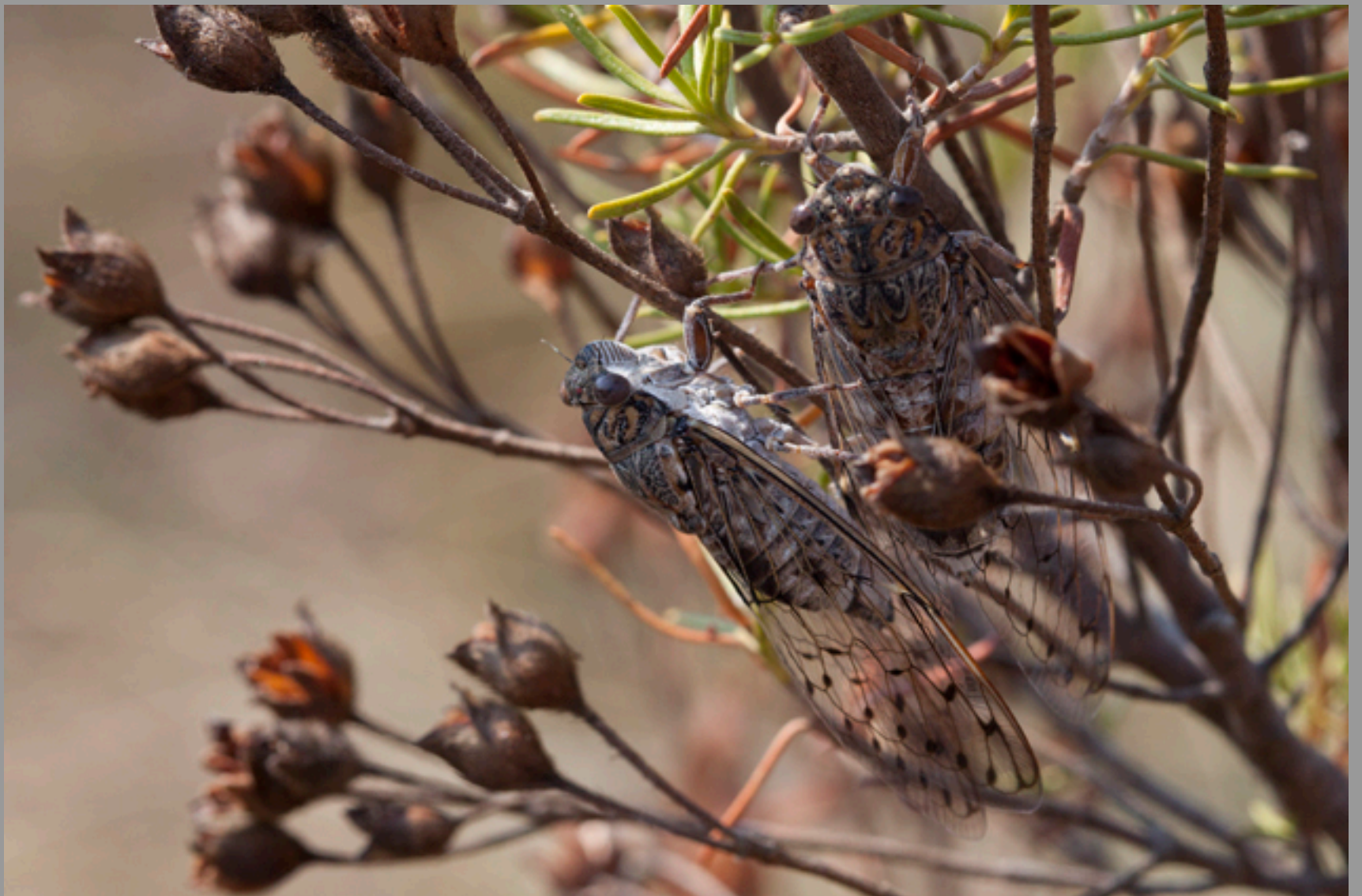
Cicada orni , male and female