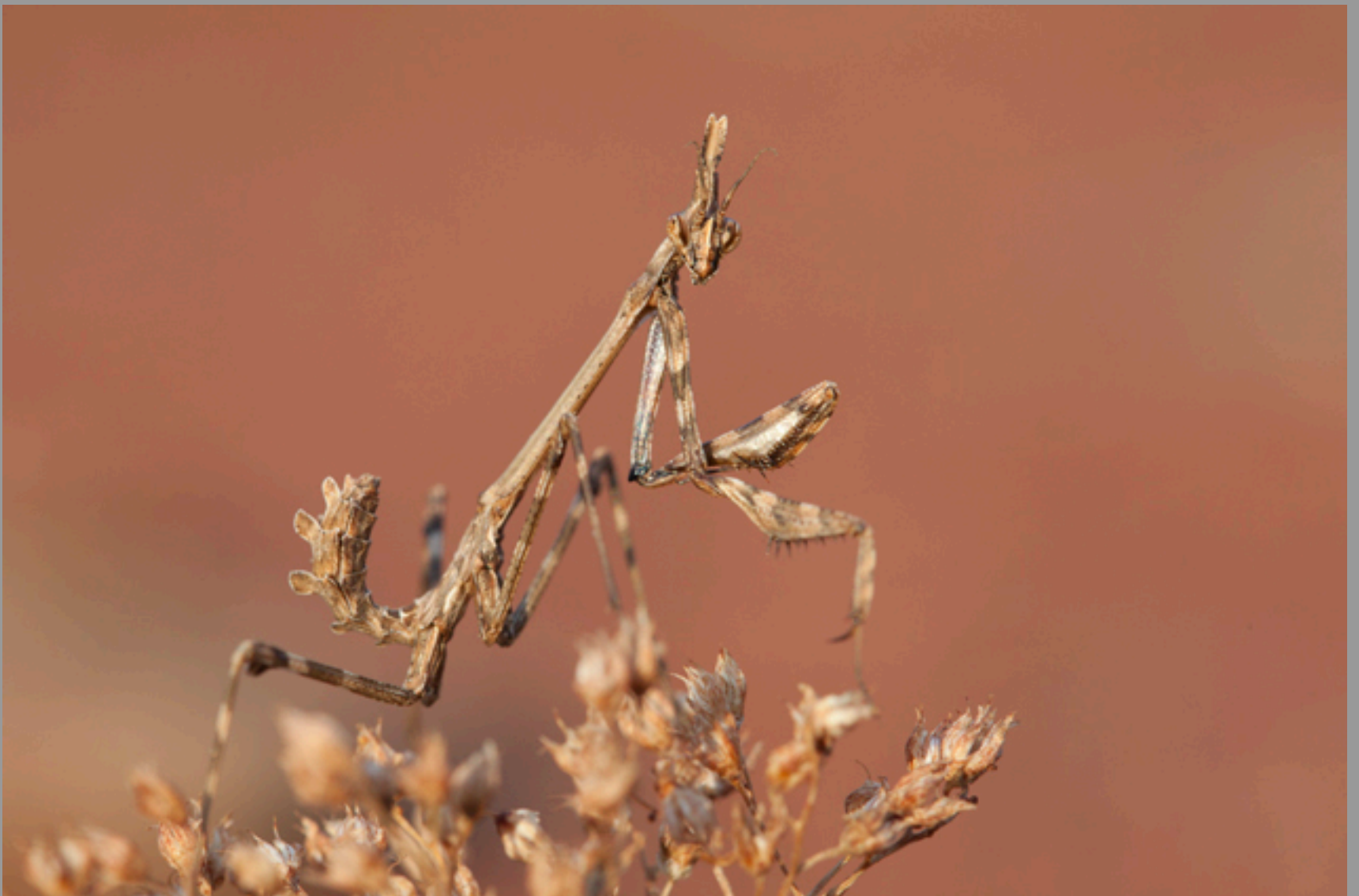
Empusa pennata , young