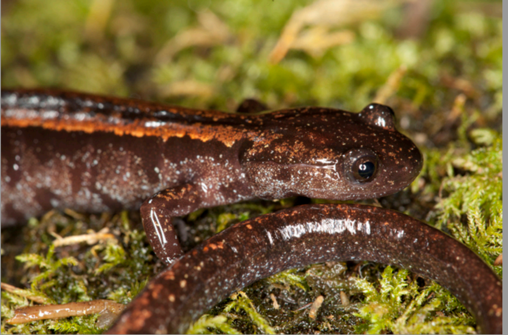
Chioglossa lusitanica longipes