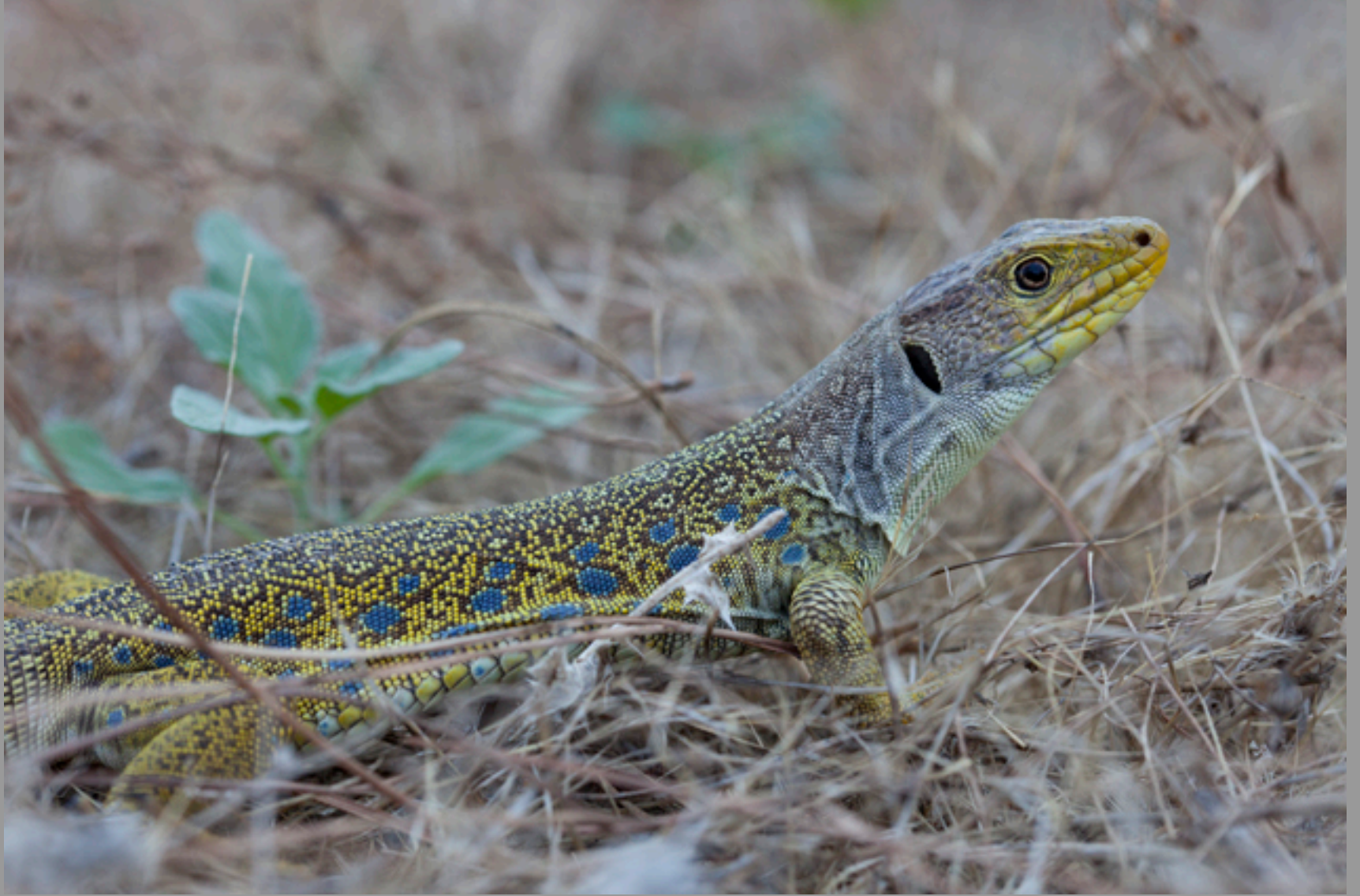
Timon lepidus lepidus