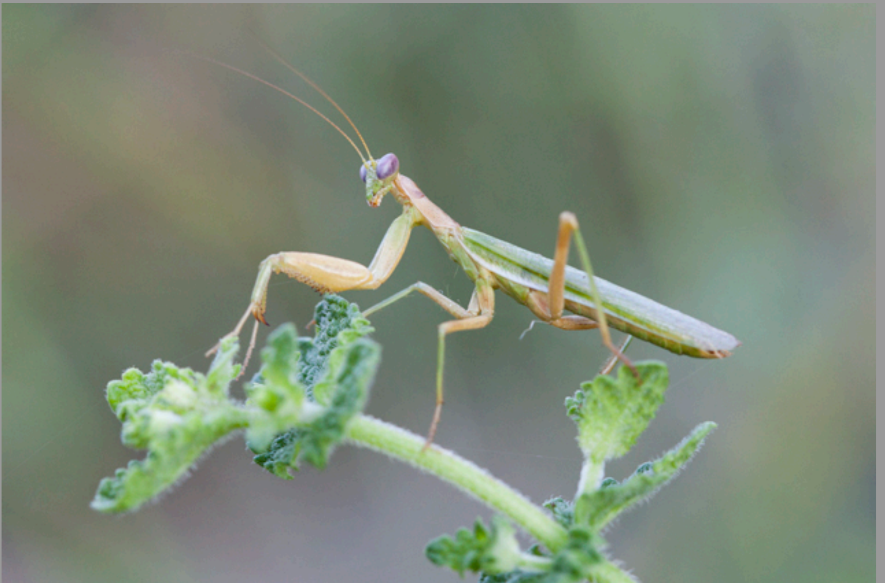
Ameles spallanziana , green male