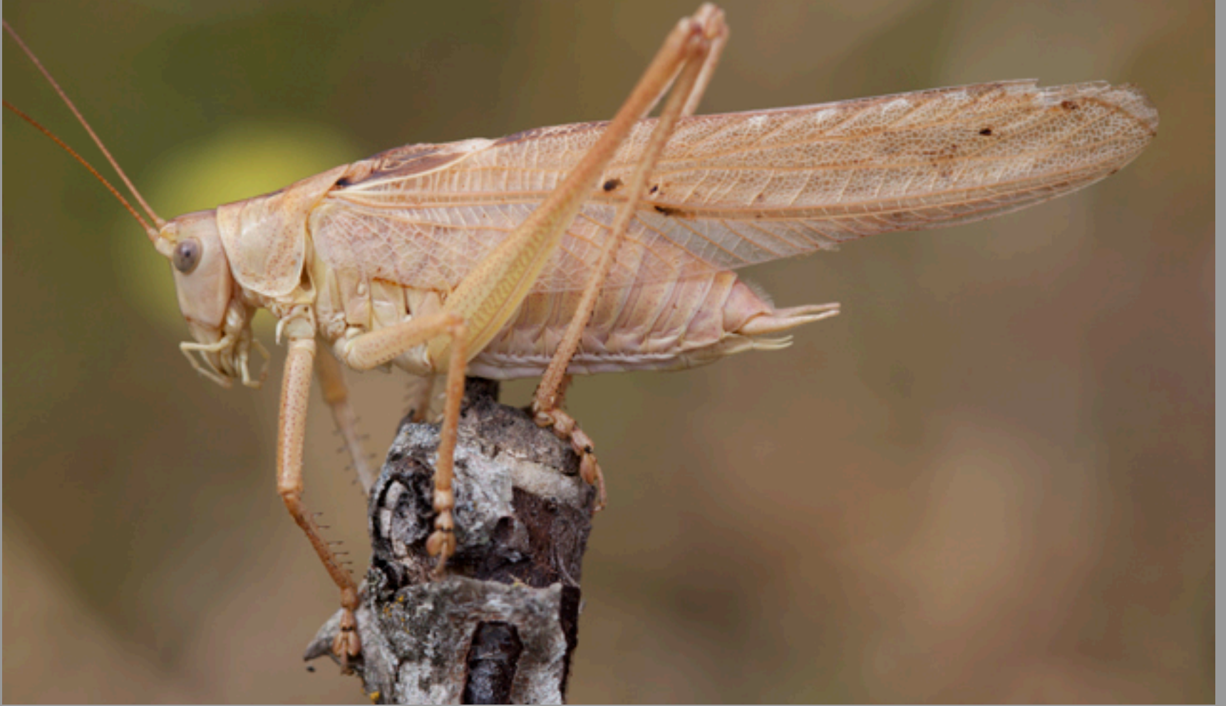
uncommon brown form of Tettigonia viridissima