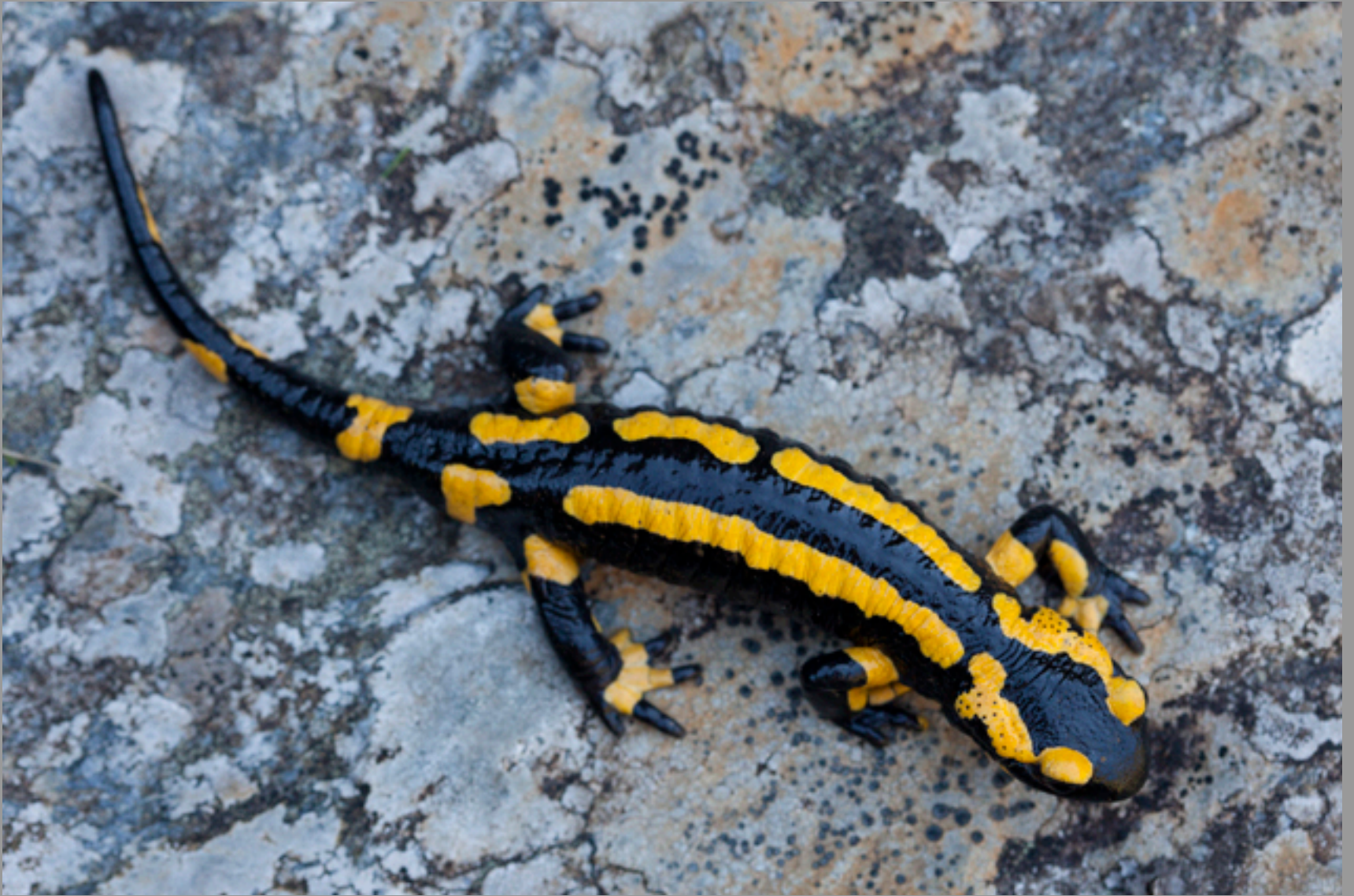
Salamandra salamandra terrestris

Back to the Iberolacerta aurelioi spot. The weather was frankly different than in July. Again cold and thick mist (near 0°C in the night). I slept on the parking and the next day, with the same weather I started to make this report in my car. The third day, same weather, I started to sort my pictures. I found randomly a Salamandra salamandra - probably - terrestris larvae and one adult of Zootoca vivipara louslantzi . In the dark, I took a look around the parking and found about ten Salamandra . The fourth day, I woke up beneath a full blue sky and hastily went in the mountain. After checking some wrong places, I reached the right spot at 10:00 AM. But low temperature (3°C) and wind didn't help. By luck I saw sneakily one lizard and stayed around. At 11h00 AM, several I. aurelioi were outside, but very wild ; probably the most difficult Iberolacerta to photograph (unbelievably sensitive to the noise). Nonetheless, with patience, I managed to graze their snout with my lens !