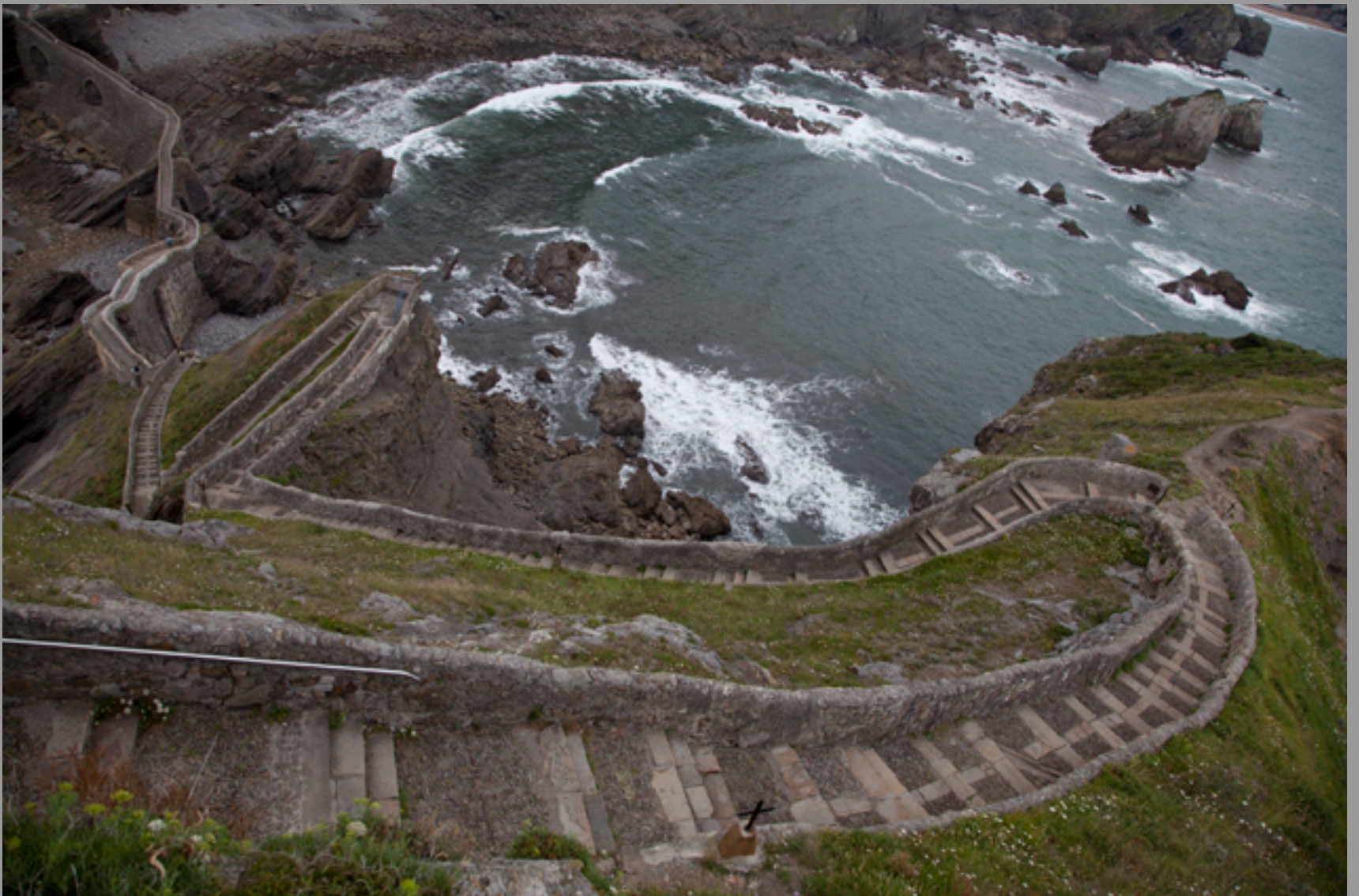
site, crazy stairs...