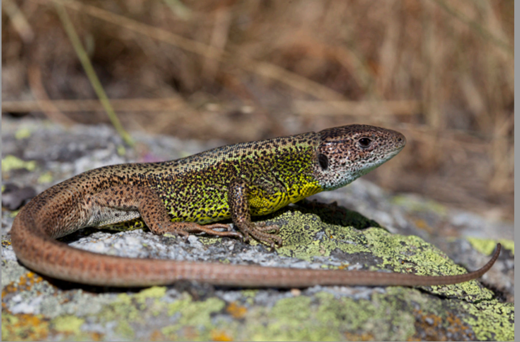
Lacerta schreiberi , male