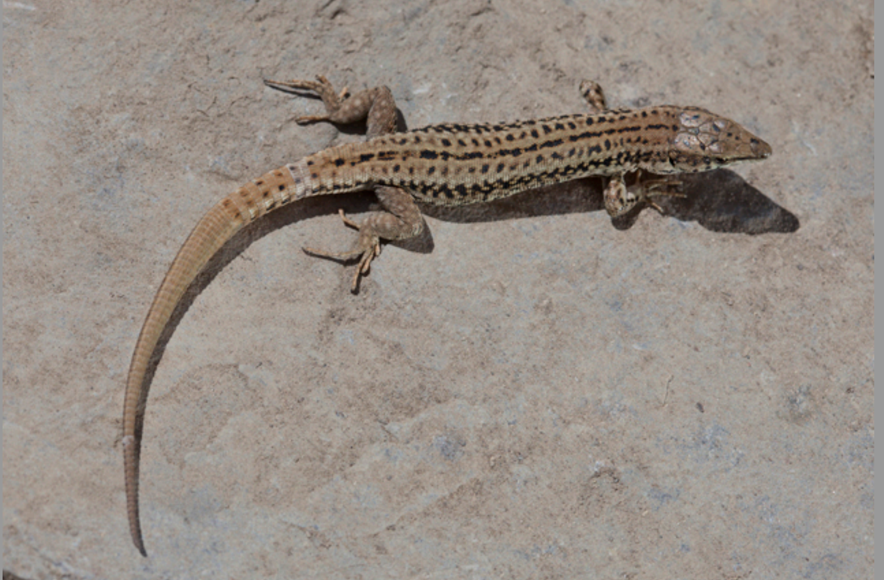
Podarcis liolepis liolepis