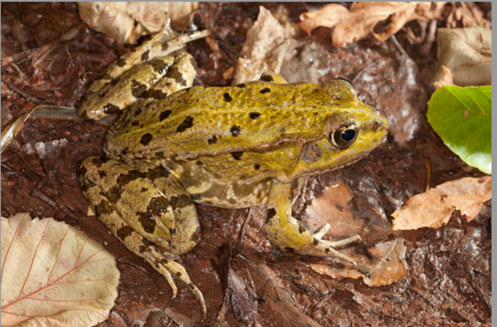
Pelophylax kl. grafi (?)