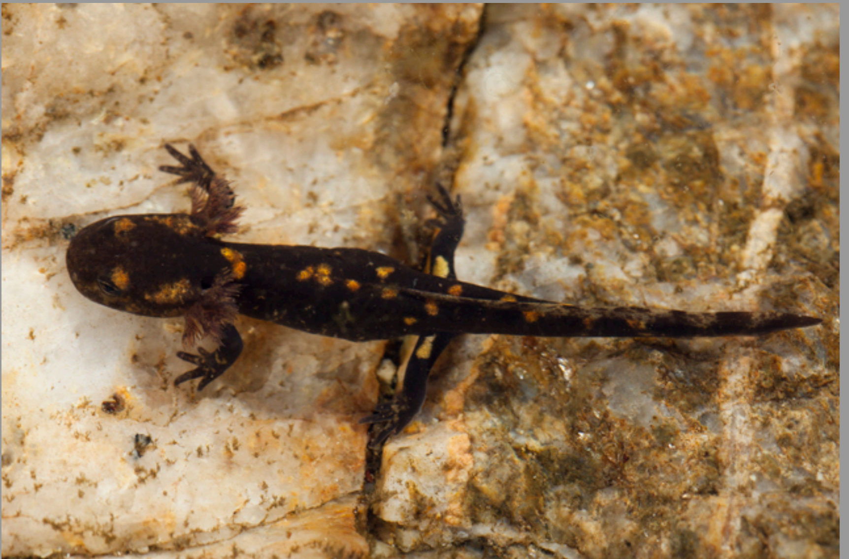
Salamandra salamandra almanzoris , larva