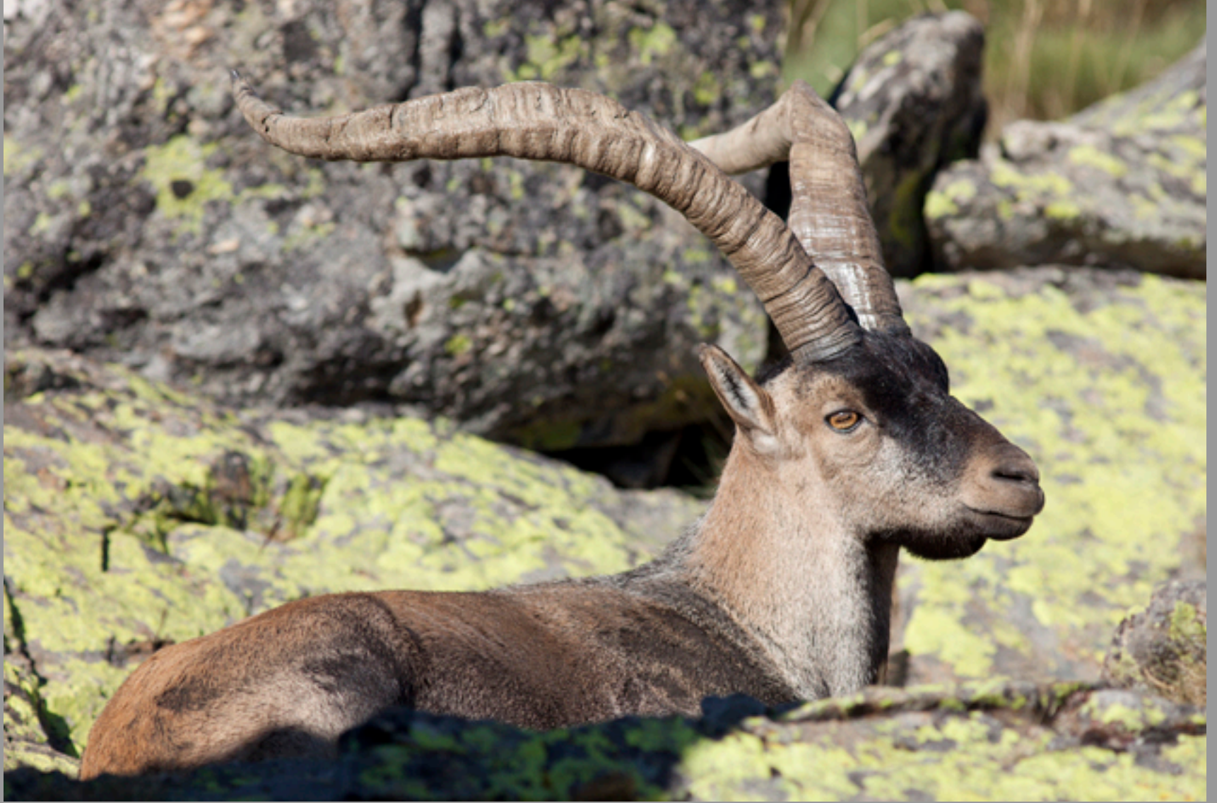
Capra pyrenaica victoriae , male