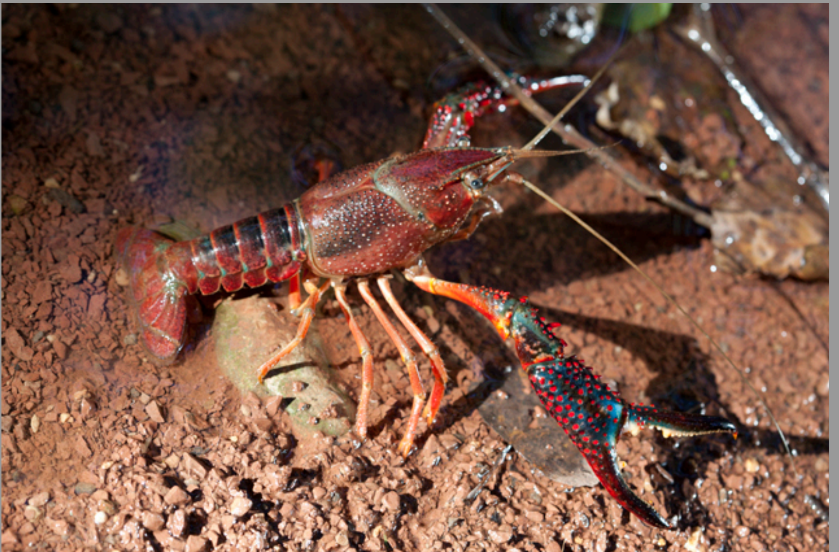
Procambarus clarki is everywhere...