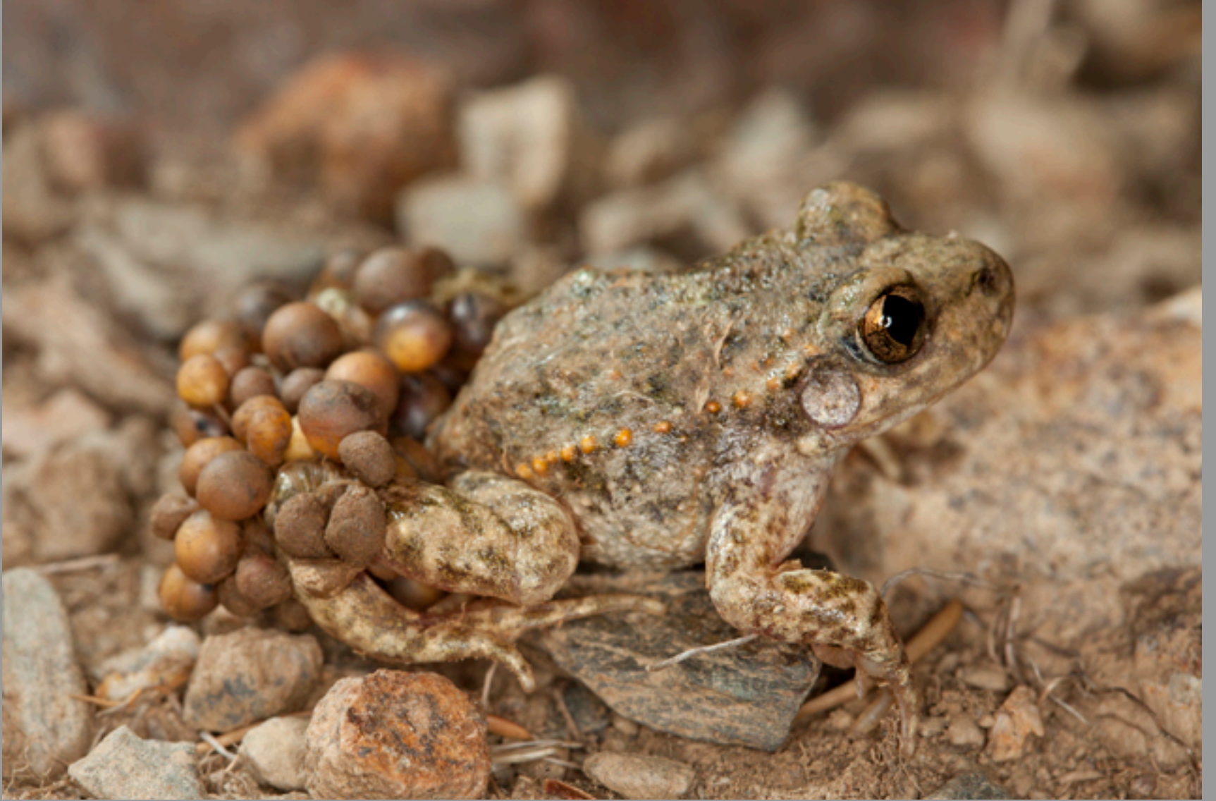
Alytes obstetricans almogavarii