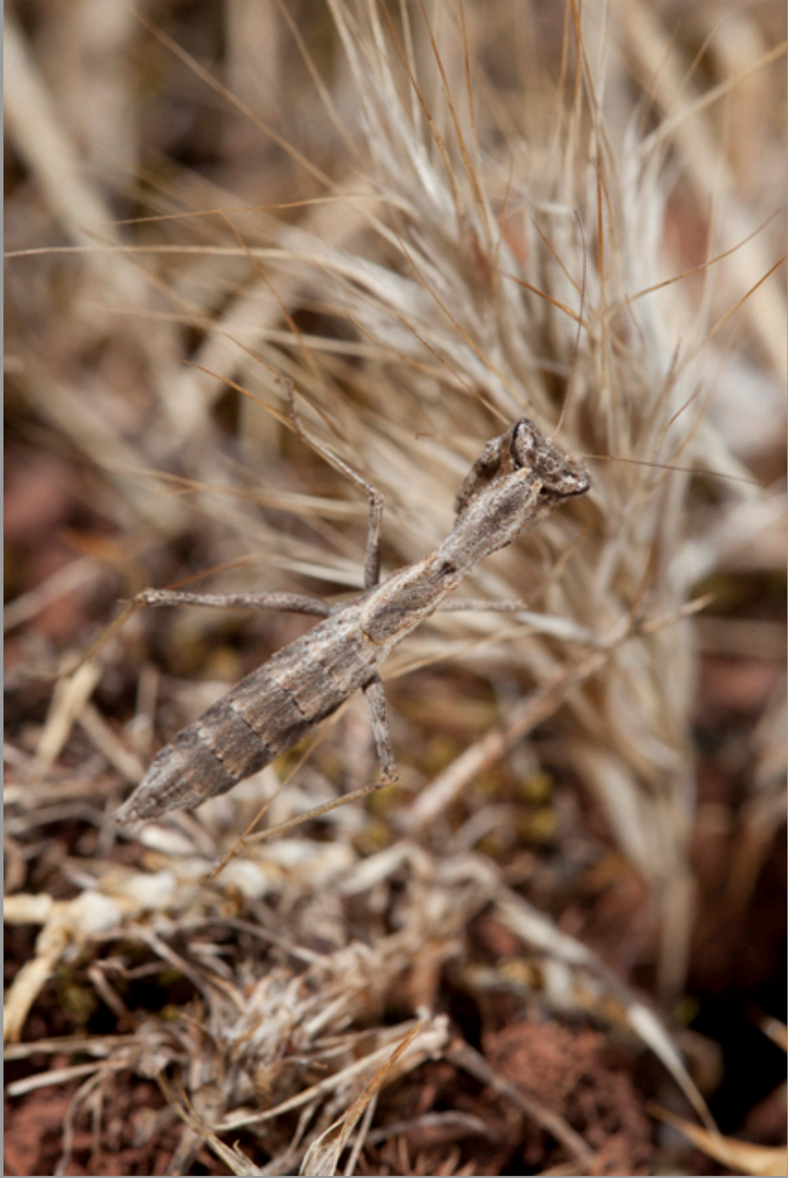
Ameles decolor , female