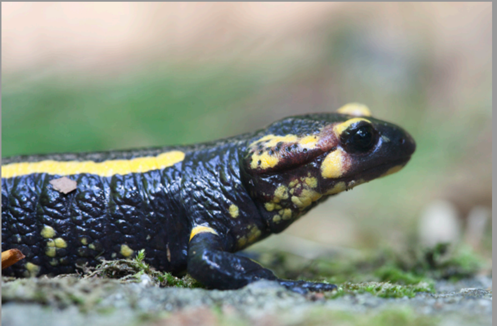
Salamandra salamandra terrestris