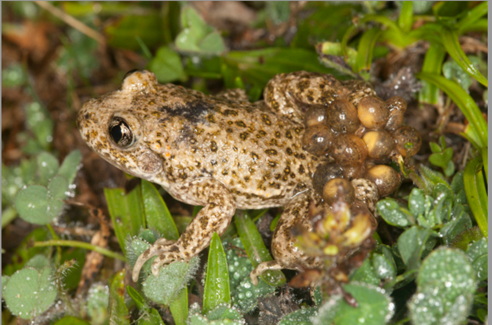
Alytes obstetricans obstetricans

for private cars in summer. Once on the area, cold and mist... disappointed. Nevertheless, Alytes obstetricans obstetricans is abundant everywhere (five under the same stone) even calling by day. In the night, x3 Rana temporaria parvipalmata but one KOR. I decided to leave toward Burgos, waiting for a future better "reptile day" in the Picos.