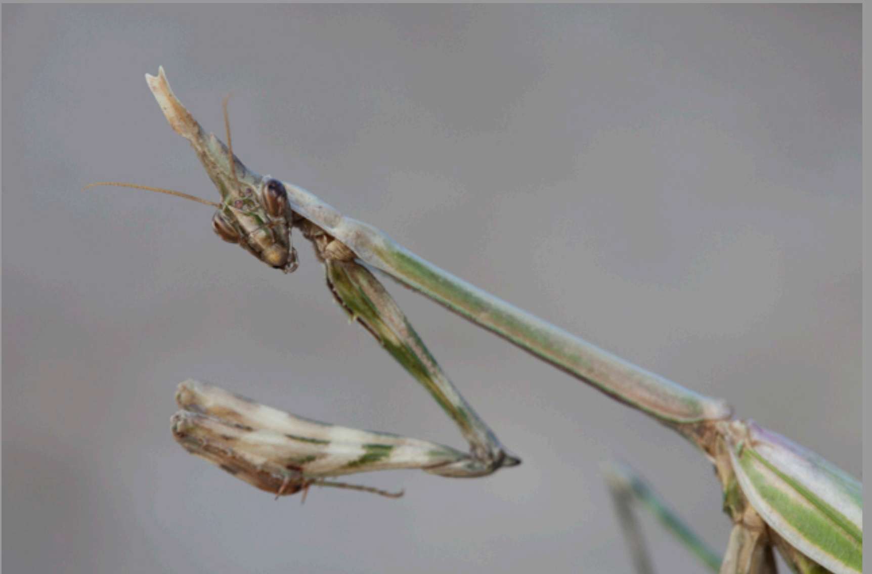
Empusa pennata , female