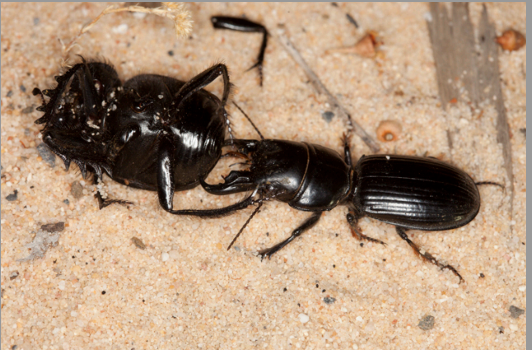
Scarites cyclops eating a Scarabaeus sacer