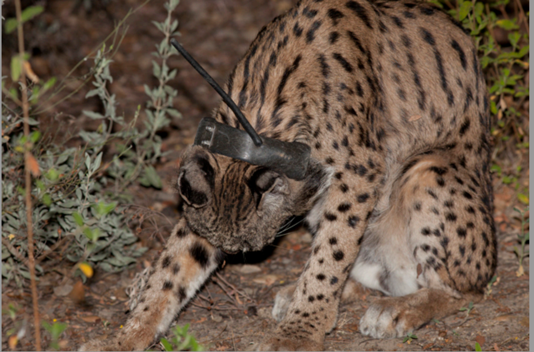
... with a big necklace :o(