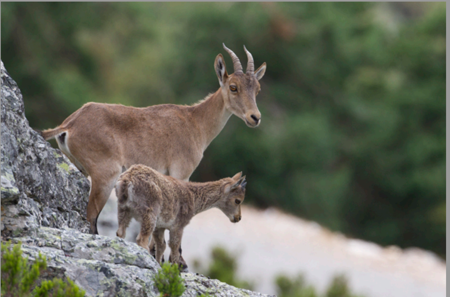
Capra pyrenaica ..