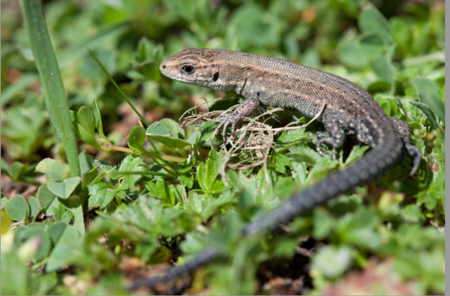
Zootoca vivipara louislantzi , young