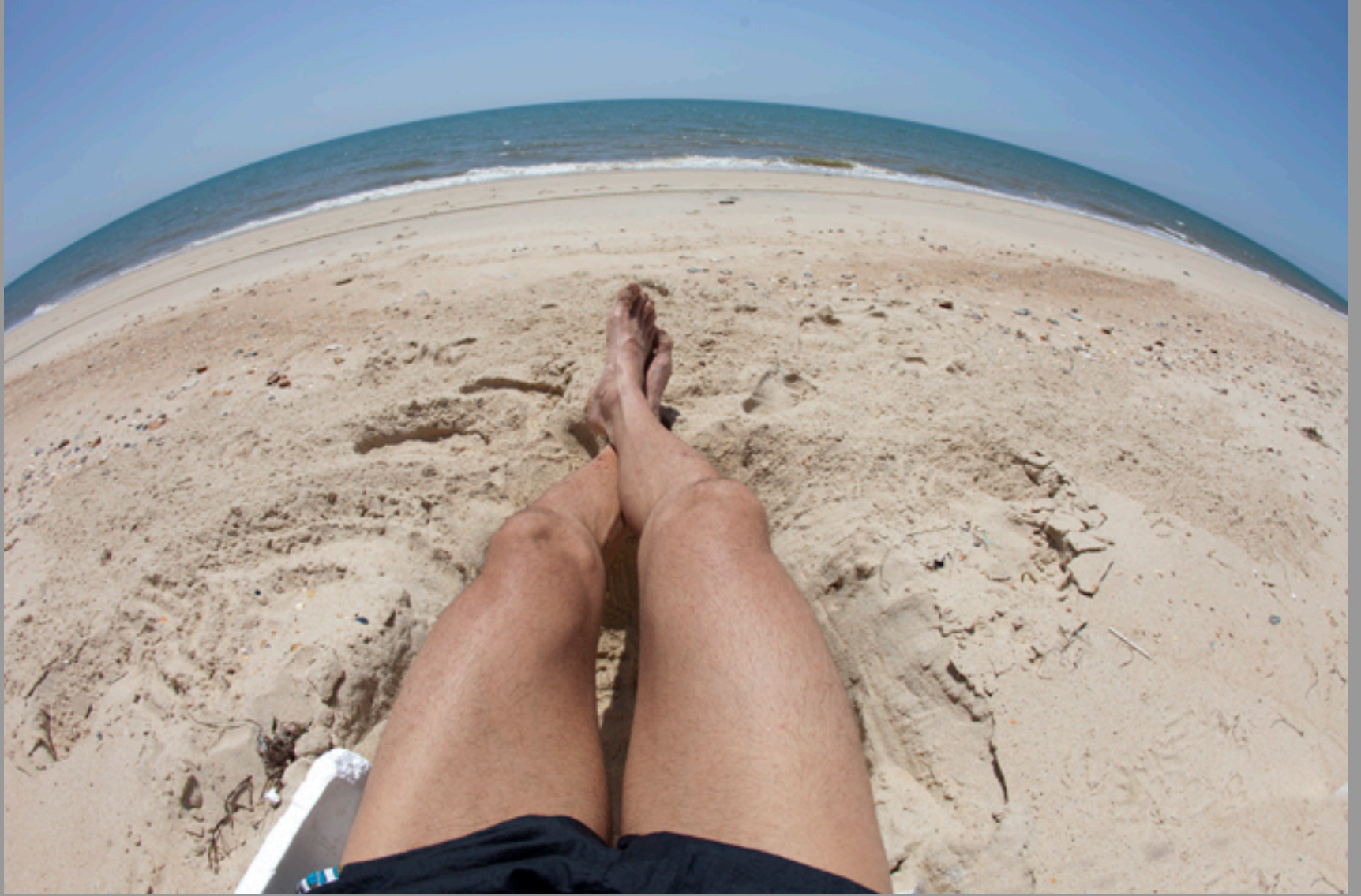
break - Farniiiiiiiiente...