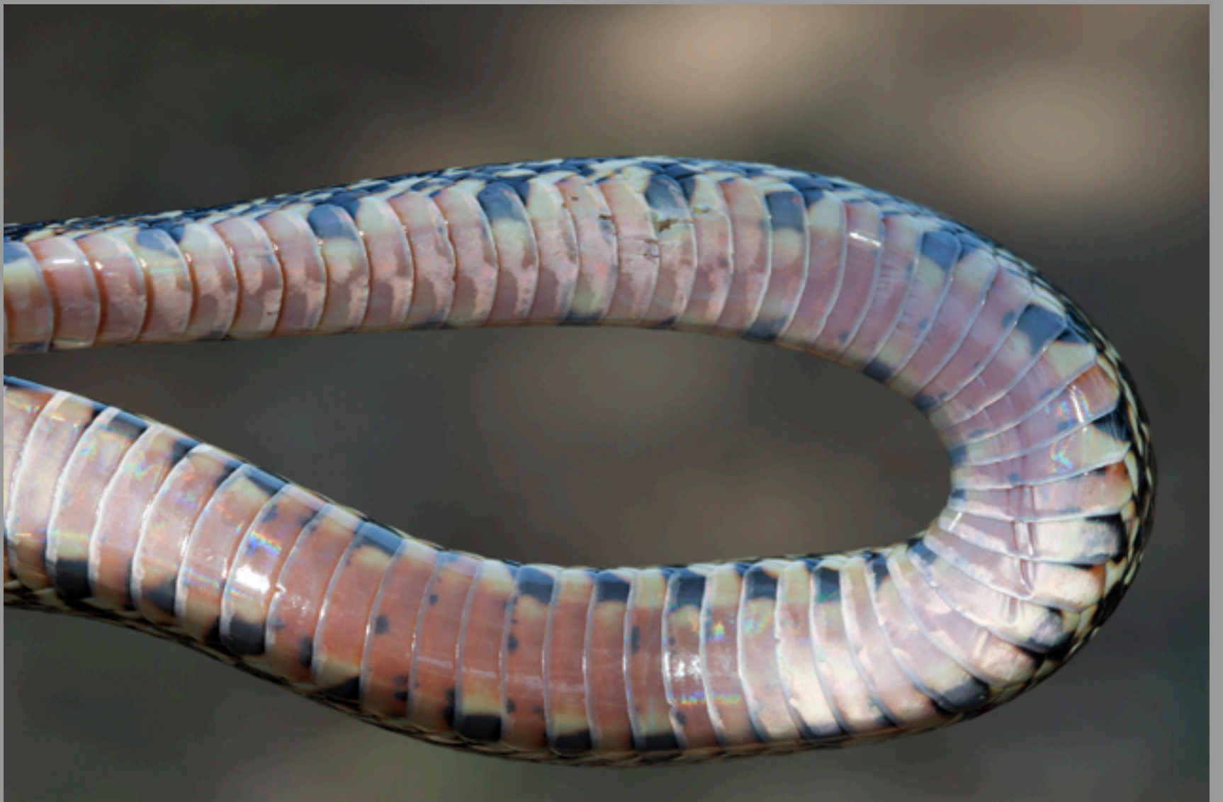
nice pink pearly belly