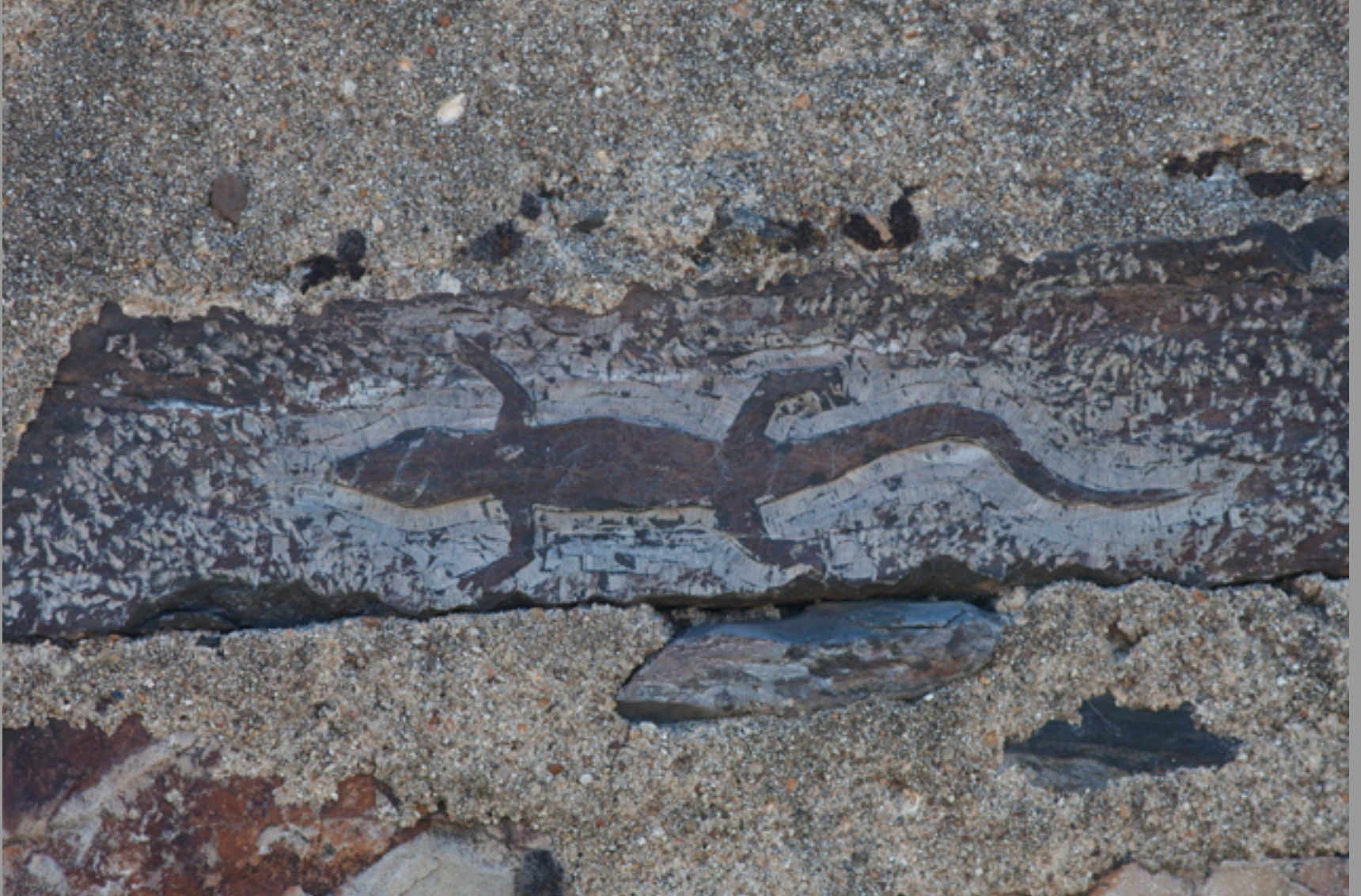
the only one Iberolacerta martinezricai ... like a shadow...