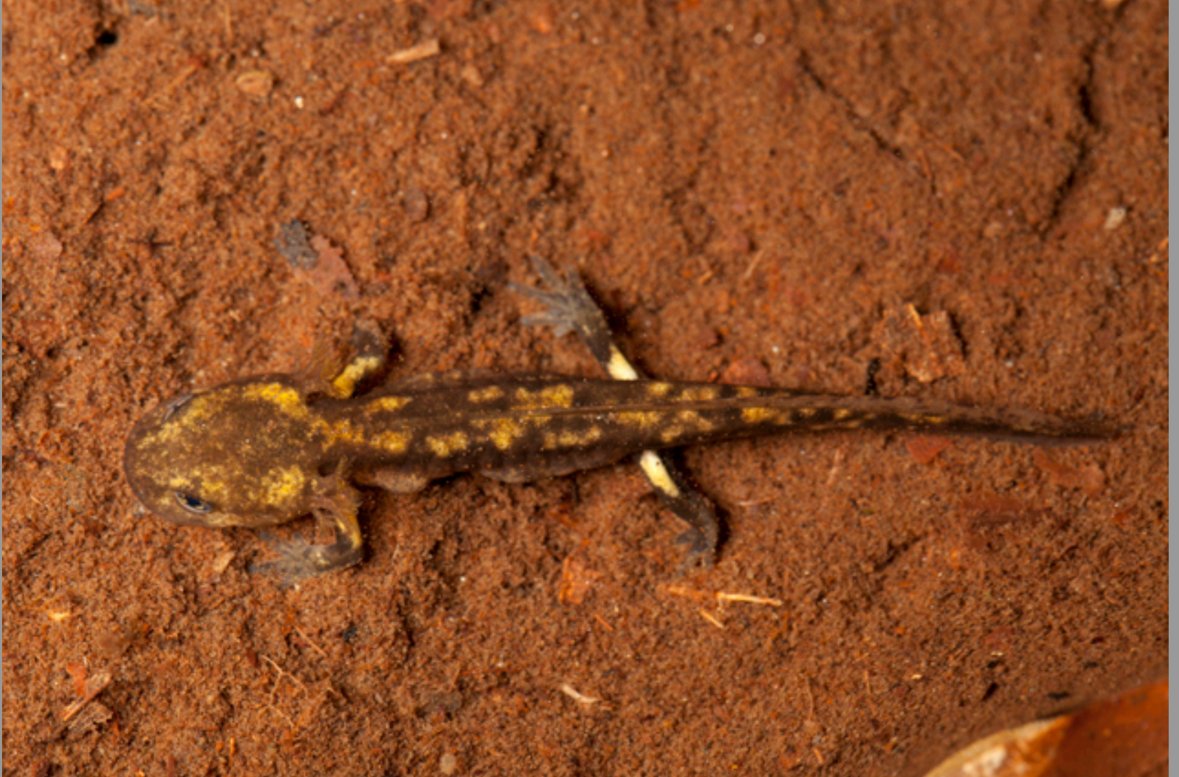
Salamandra salamandra terrestris , larva