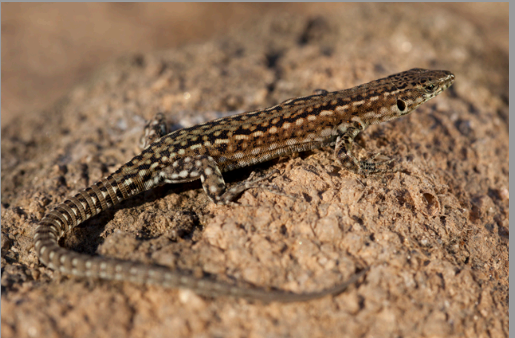
Podarcis guadarramae guadarramae