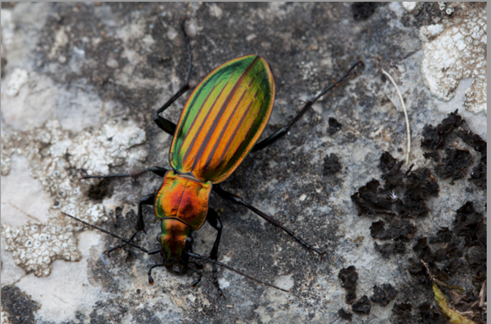
Chrysocarabus lineatus avilensis