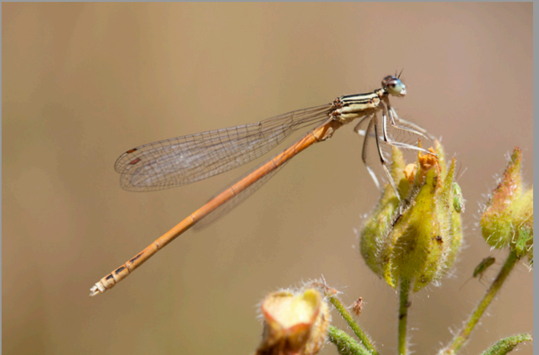
Platycnemis acutipennis , male