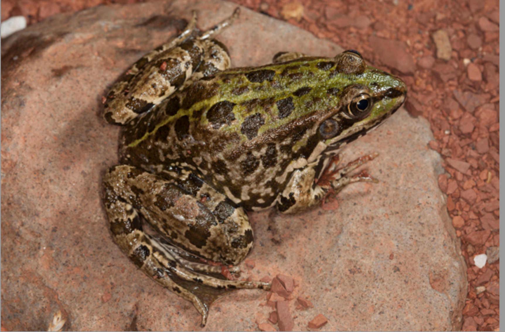
Pelophylax kl. grafi (?)