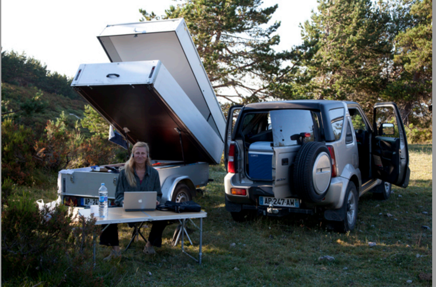
Cat at camp site