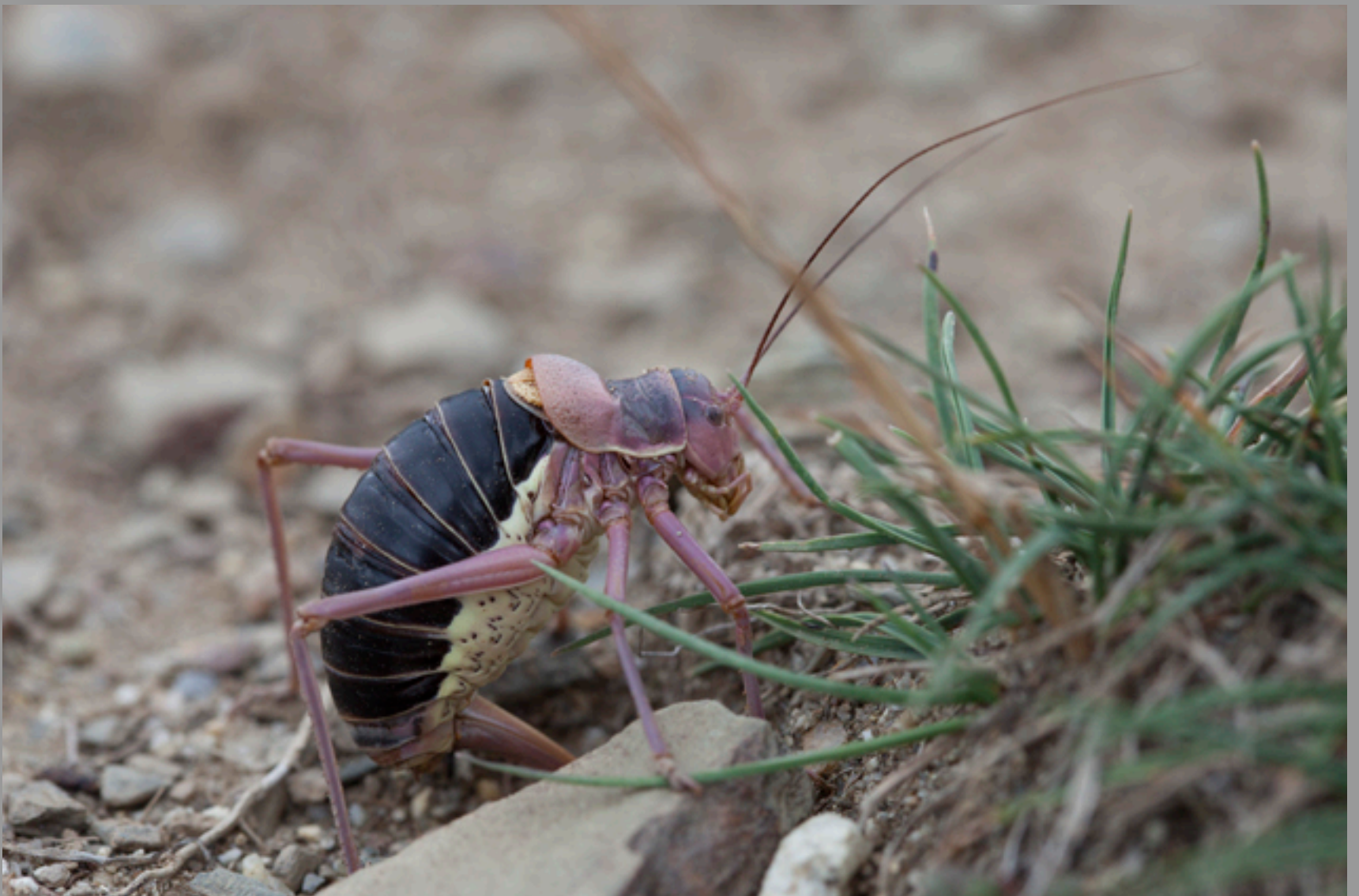
Ephippiger ephippiger laying