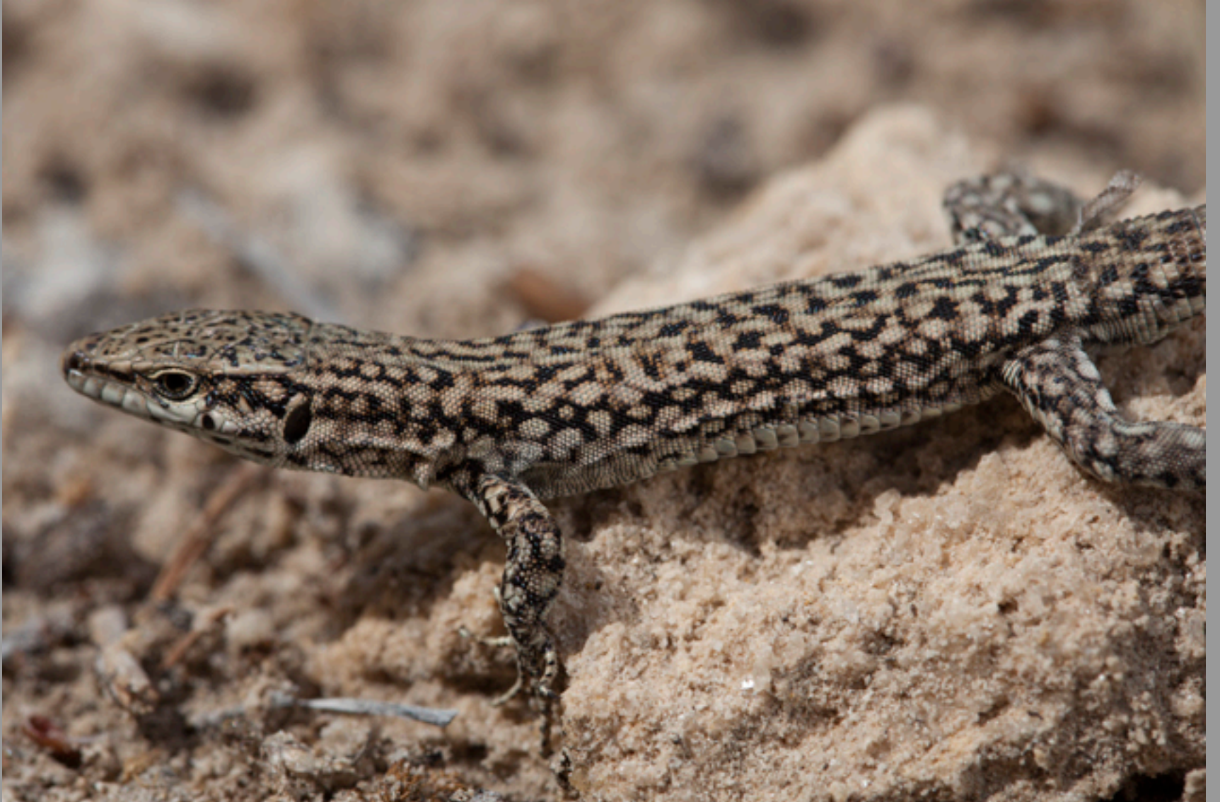
Podarcis liolepis cebennensis

We started our research near Millau to find Podarcis liolepis cebennensis . Two small were found... Other species : Bufo spinosus , Podarcis muralis and Lacerta bilineata .