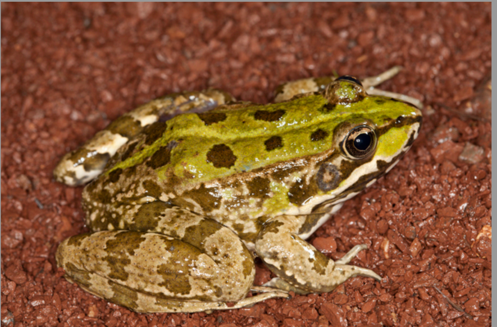
Pelophylax kl. grafi (?)