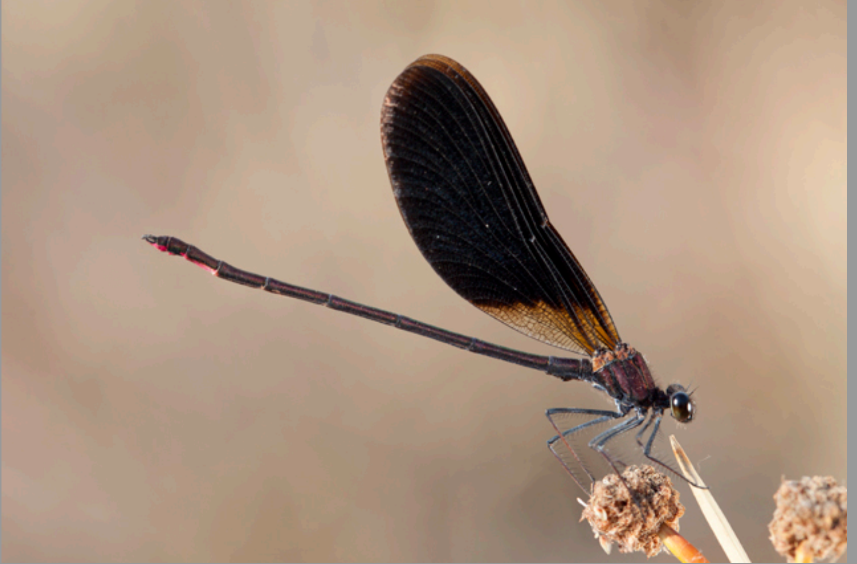
again a Calopteryx haemorrhoidalis