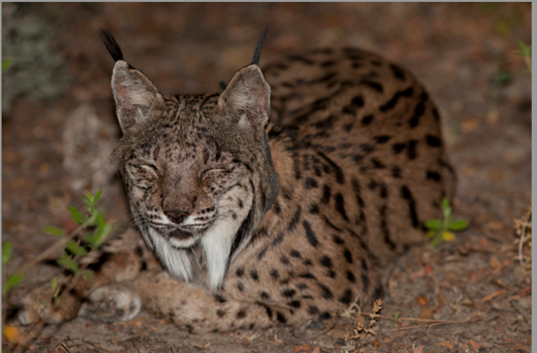
the Lynx pardina ...