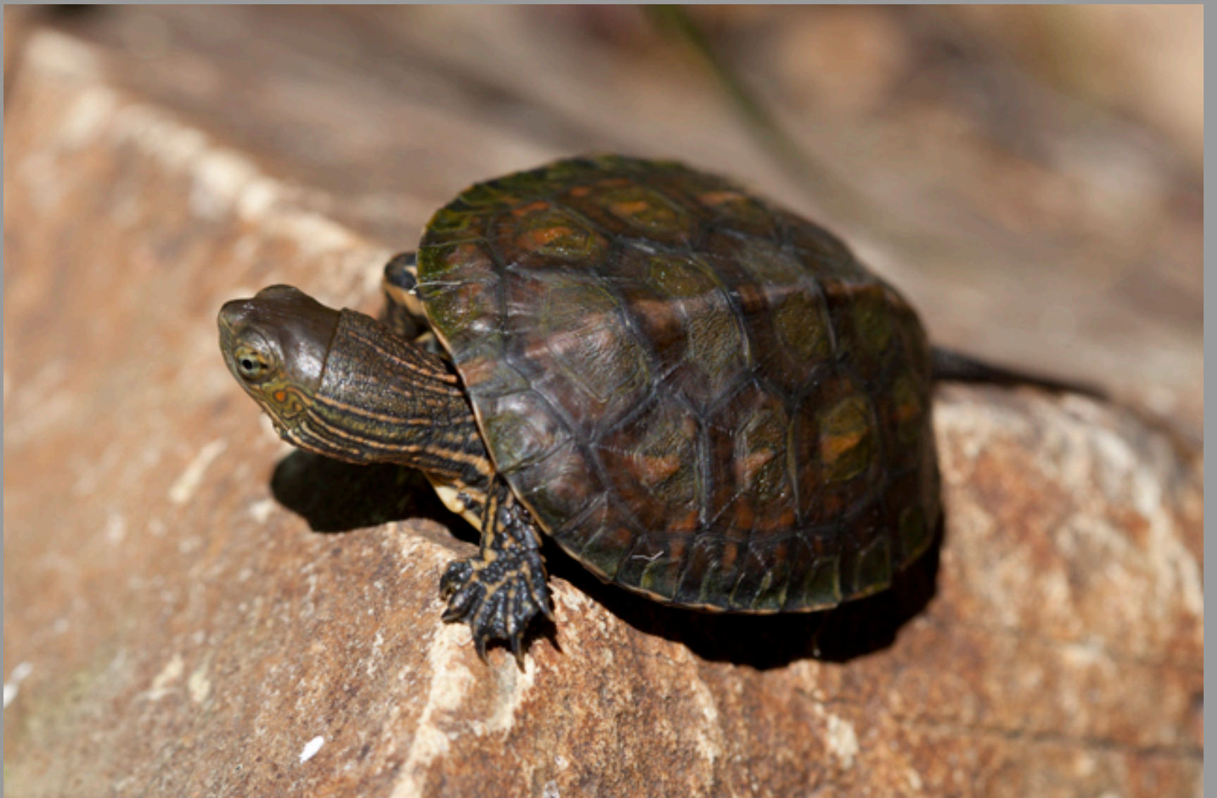
Mauremys leprosa , young