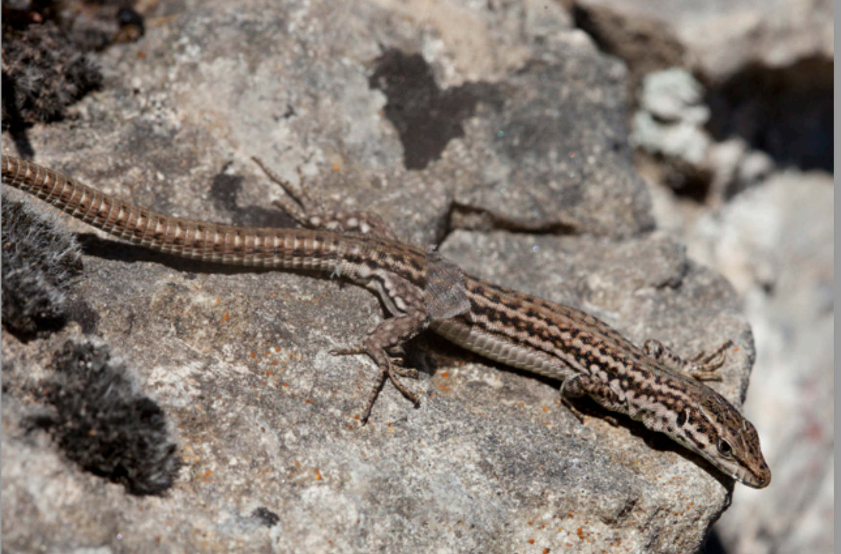
Podarcis liolepis cebennensis

This trip was useful to have a better idea of what it's possible to find in that season, making usually my trips in the spring or in fall. By piece of evidence, Iberolacerta are not easier to find in the summertime (in a few places, results are even far better in September/October) as for snakes, they are always difficult to find after the spring. We made a great travel with a lot of new subspecies and species. I hope now to find the last ones of the Iberian peninsula during my next trip to sew up (temporarily) the spanish herping !