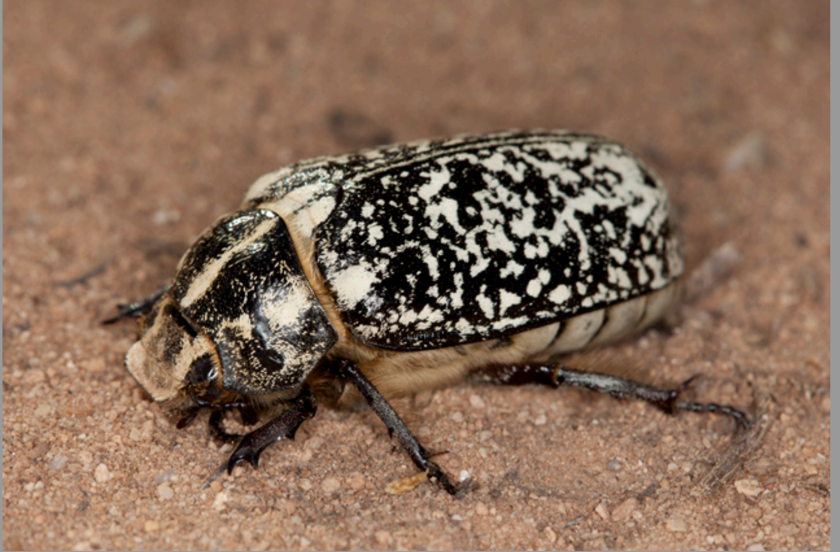
Polyphylla fullo , female