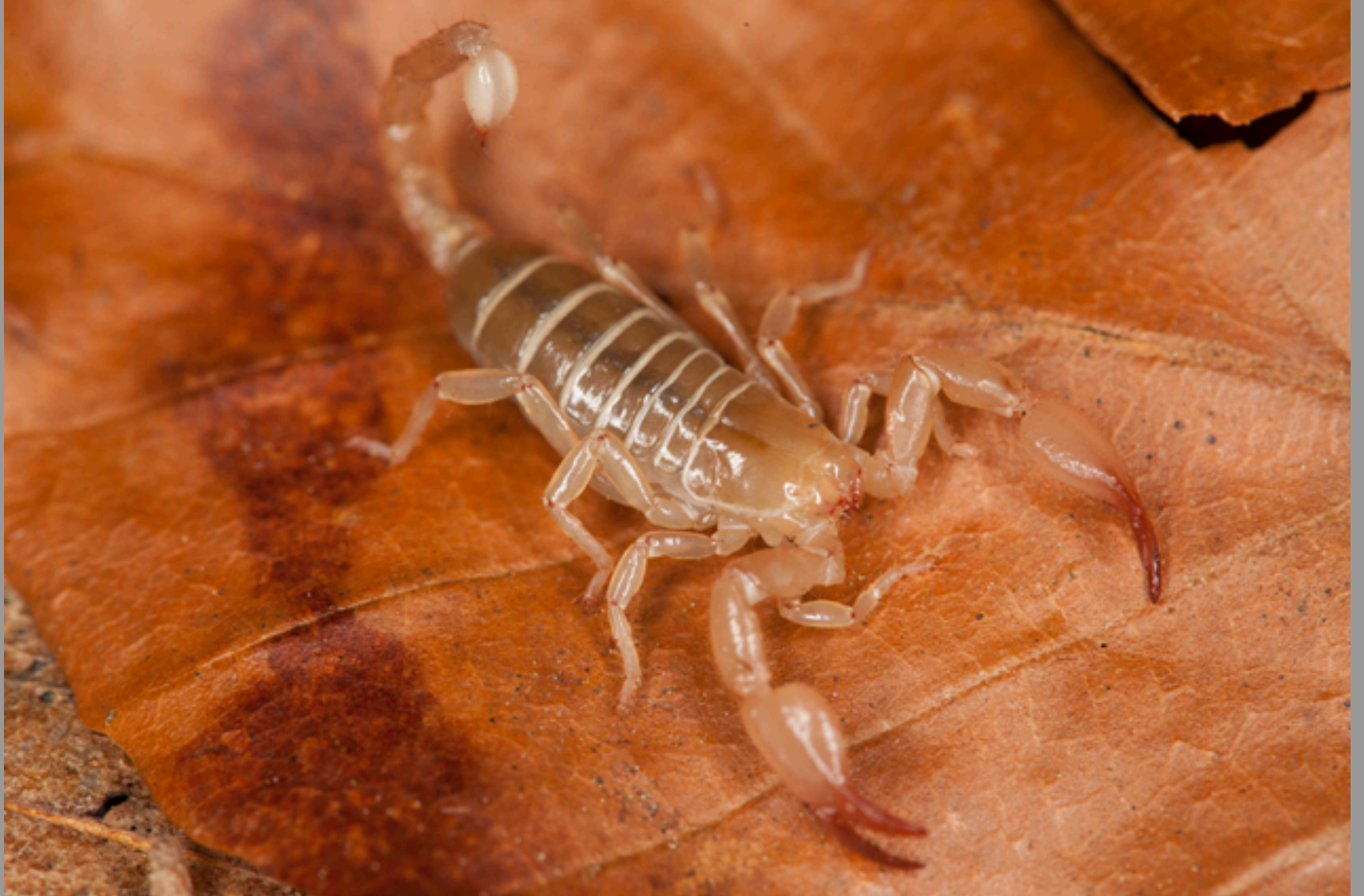
the very rare Belisarius xambeui . Notice the lack of eyes...