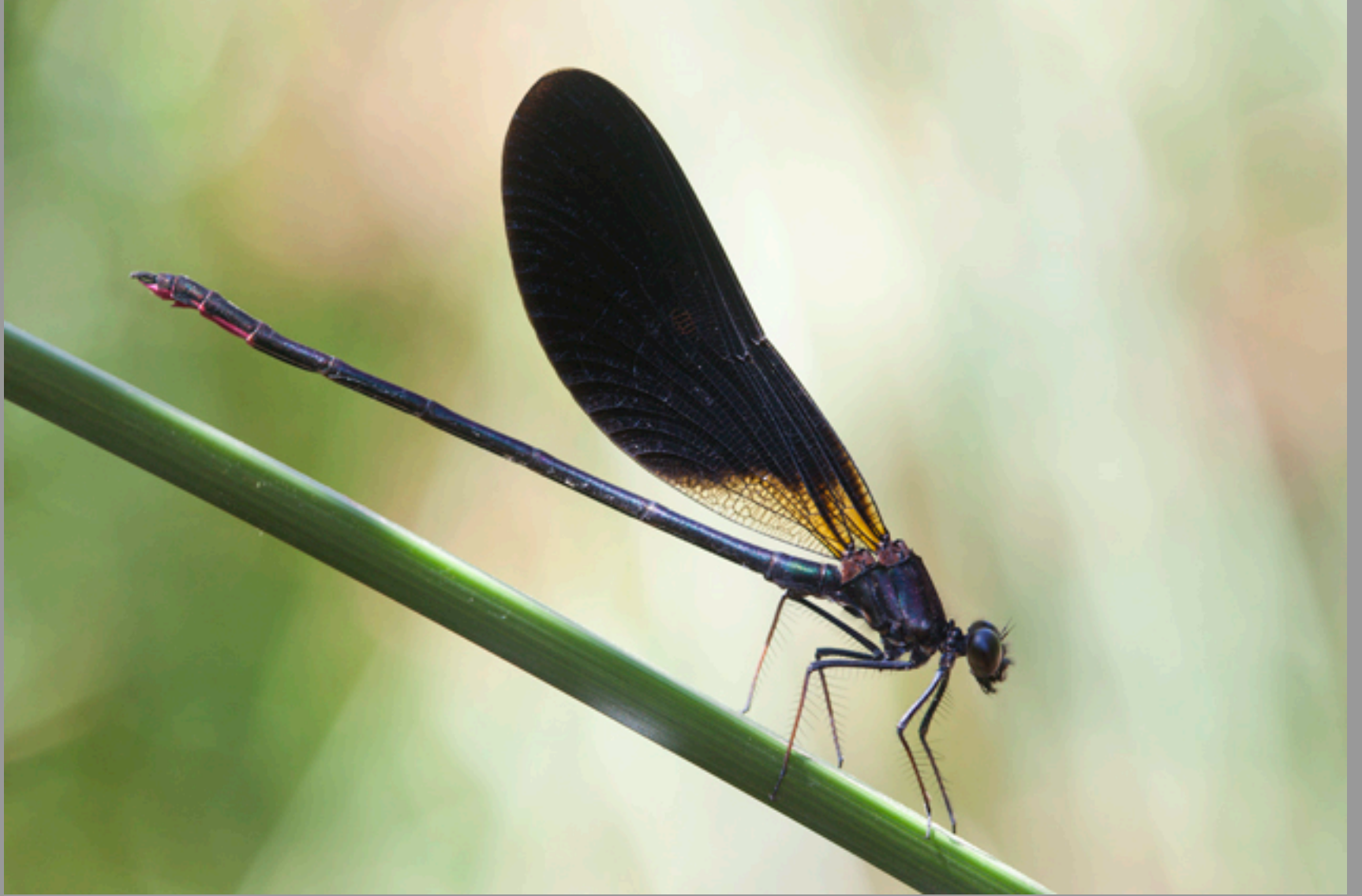
dark pattern of Calopteryx haemorrhoidalis