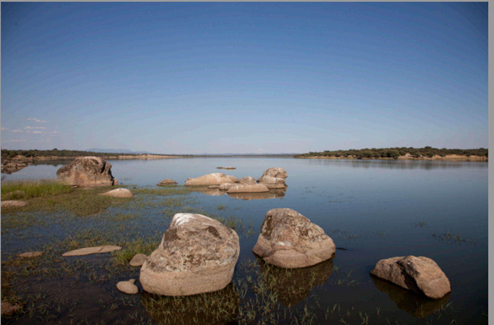
Embalse de Navalcan