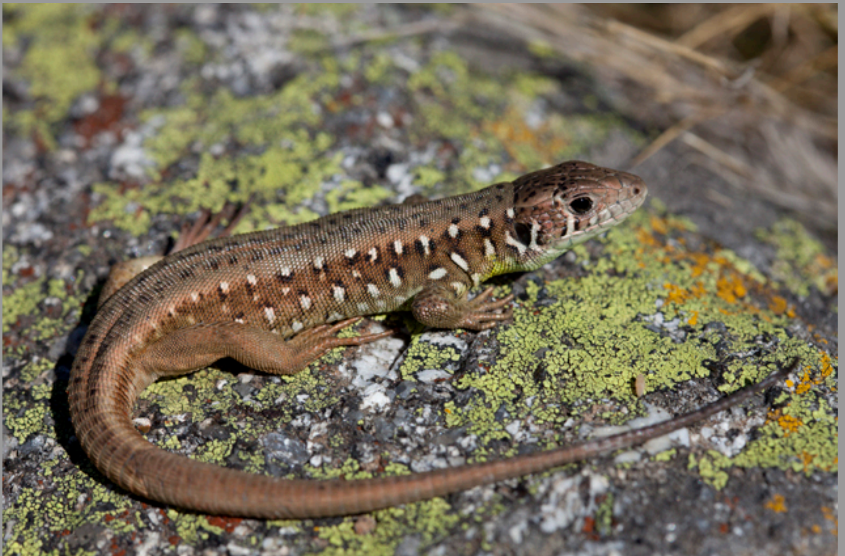
and re-again, young...