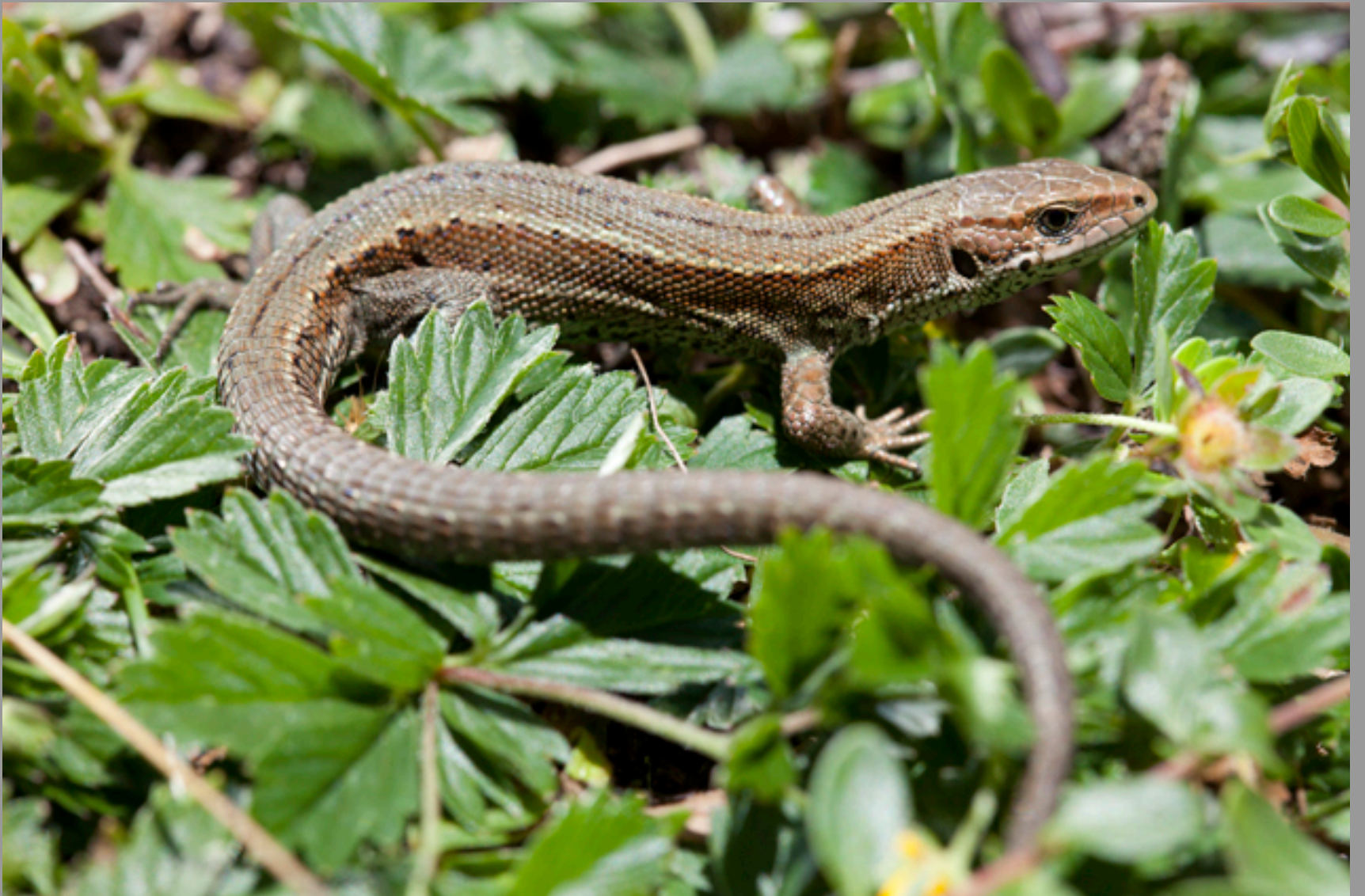
Zootoca vivipara louislantzi