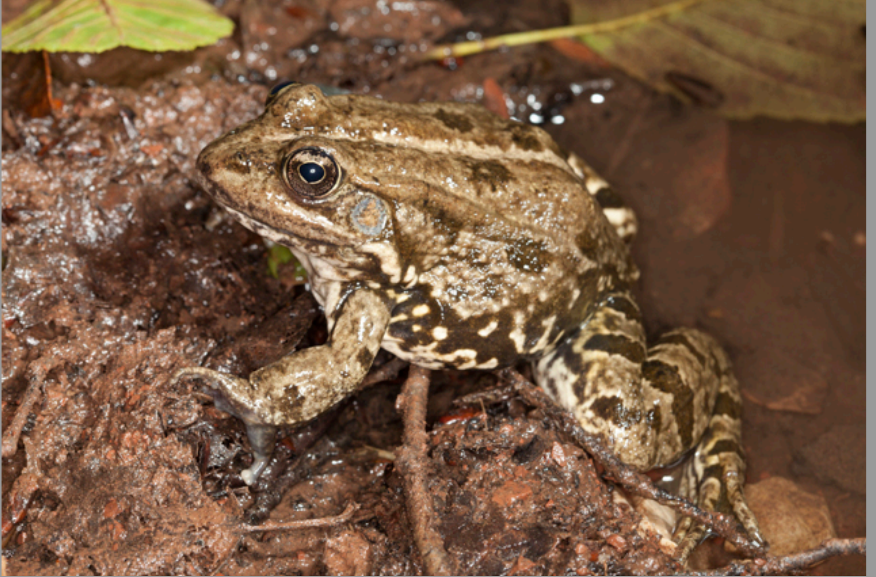
Pelophylax kl. grafi (?)