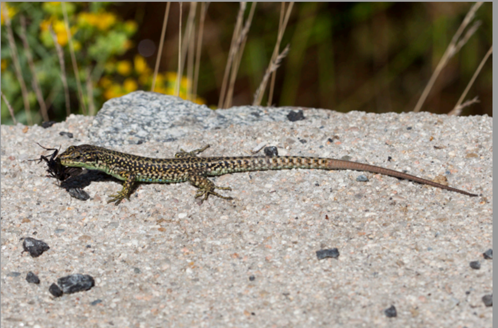
other with sandwich