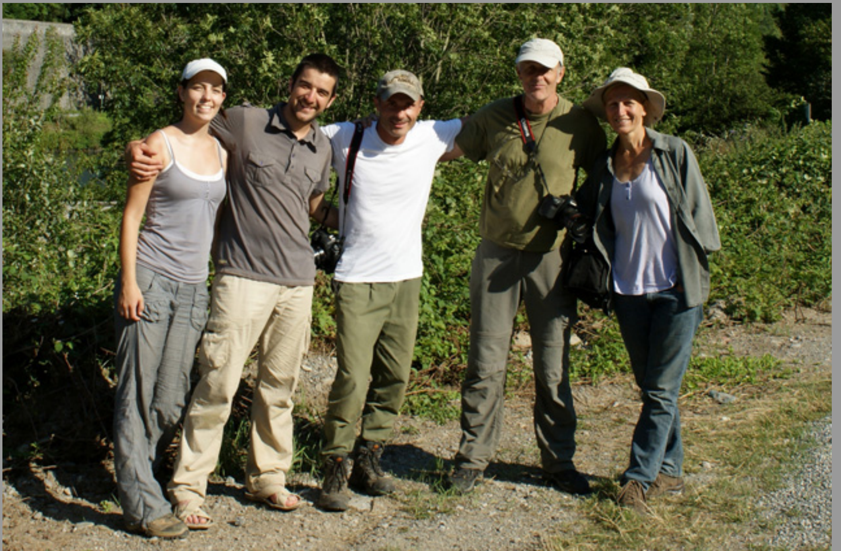
équipe de choc... © Maud Menay