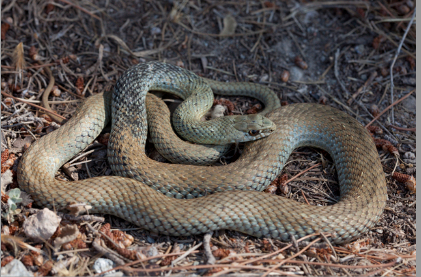
Malpolon monspessulanus found...