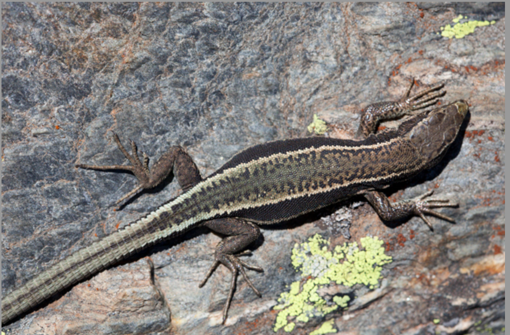
other, a basking male