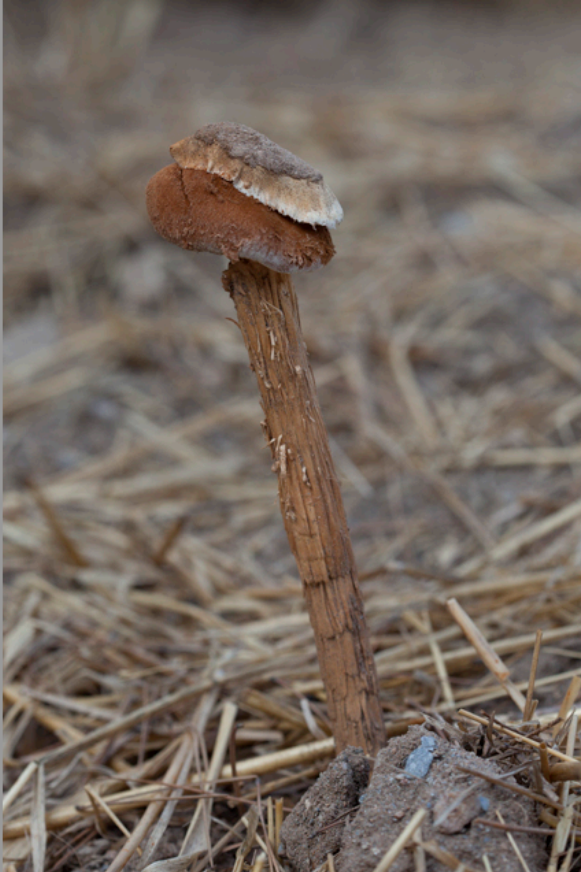
The rare mushroom Battaraea phalloides