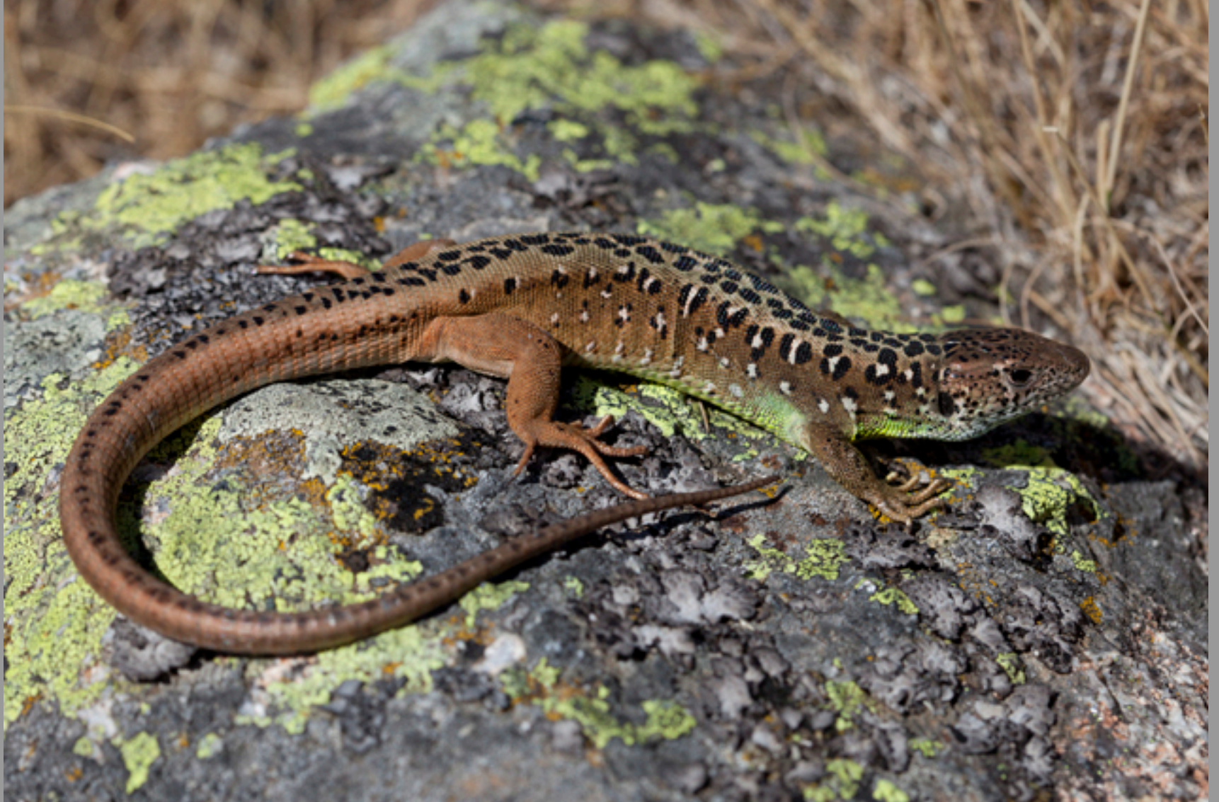
and again, female