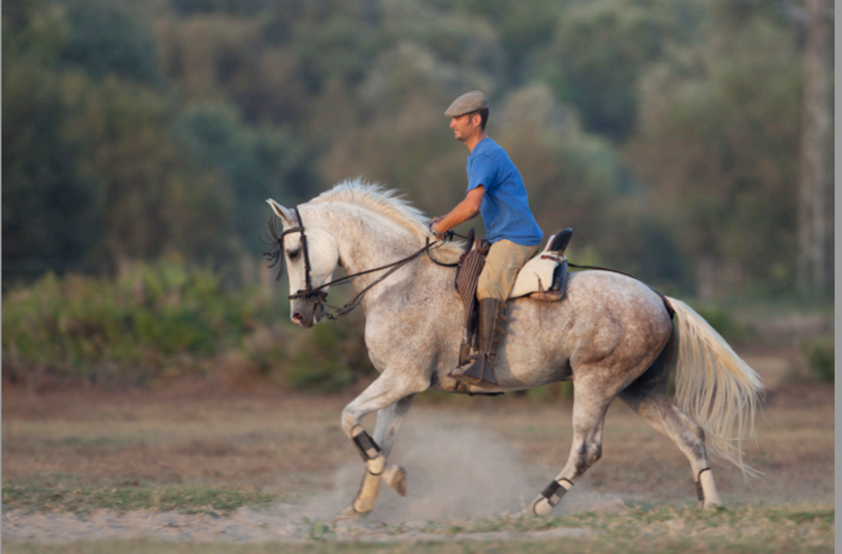
... kingdom of horses