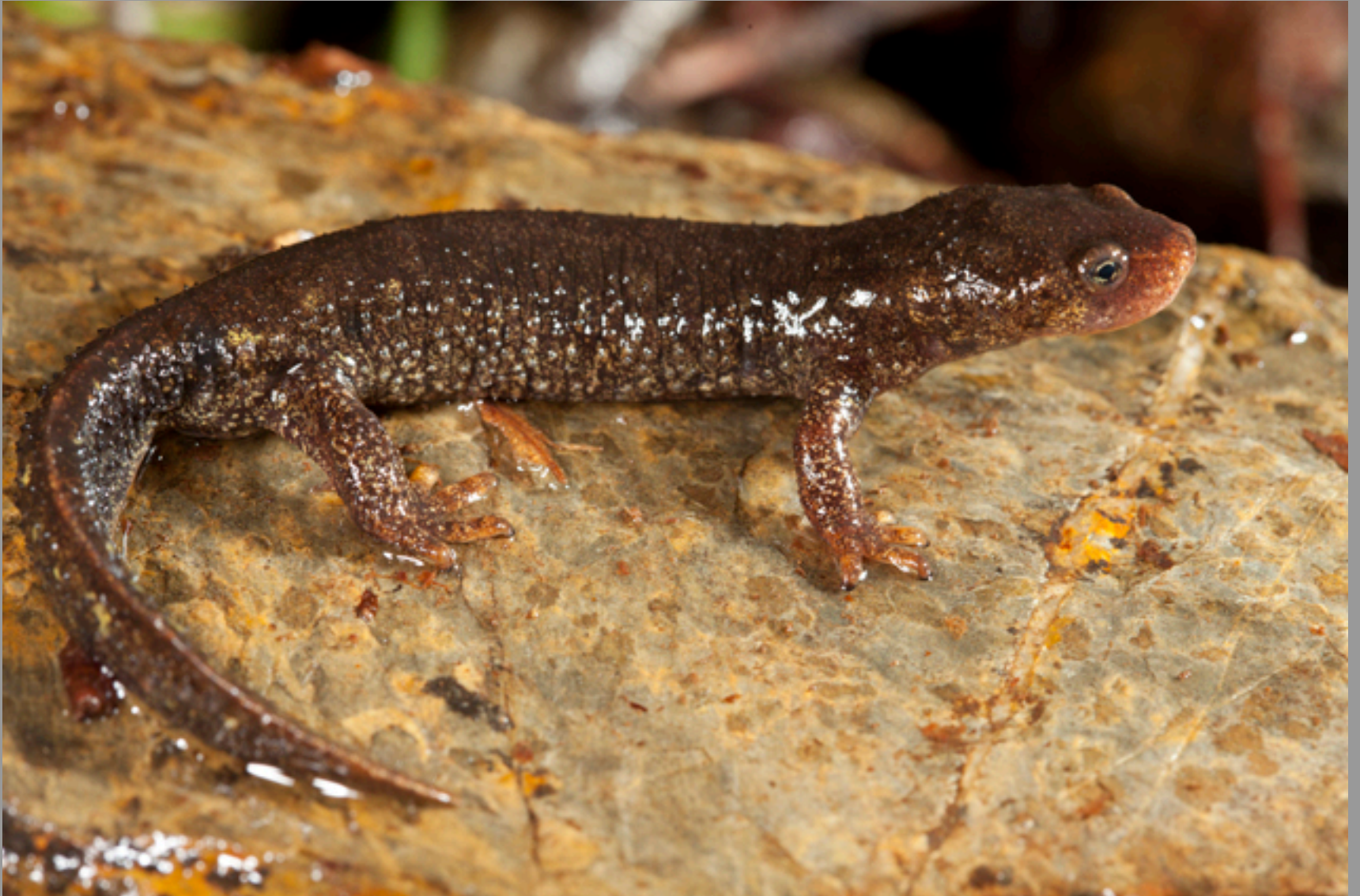
Calotriton arnoldi , female

In Montseny, I wanted to make more pictures of Calotriton arnoldi . After a long time, I finally found in a very small brook a first animal, then a second very near, both outside of water : a male and a female. Other species : Podarcis muralis and plenty of Salamandra salamandra terrestris larvae.