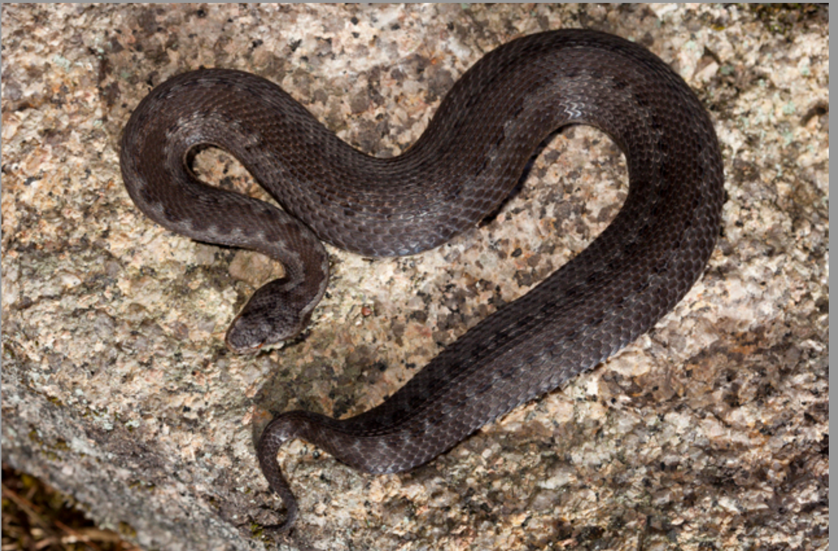
Vipera seoanei cantabrica