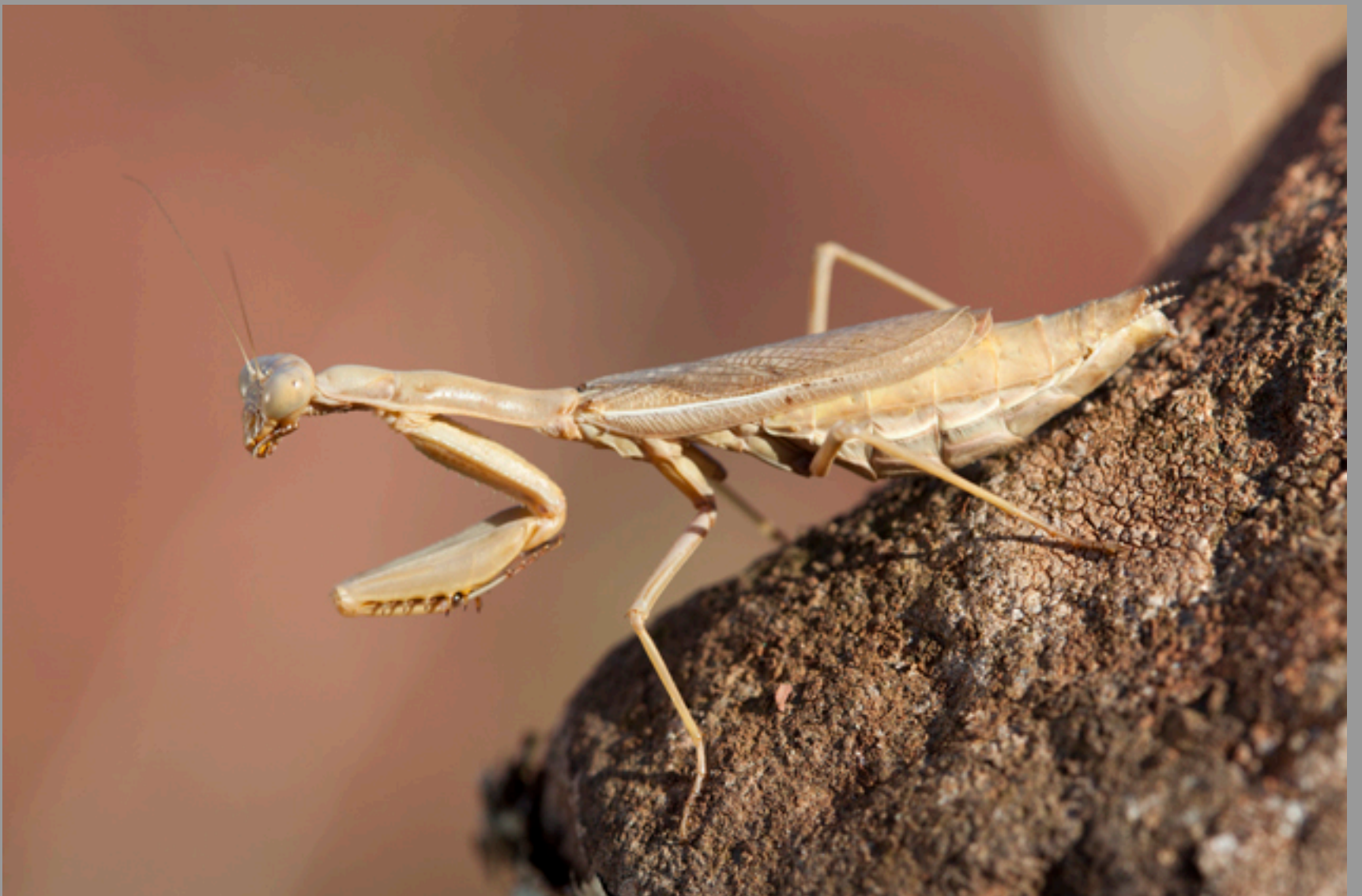
Iris oratoria , brown female