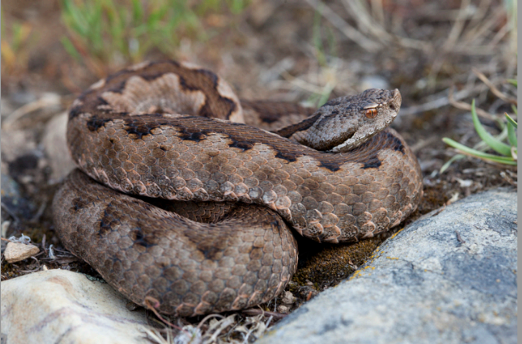
Vipera latastei latastei