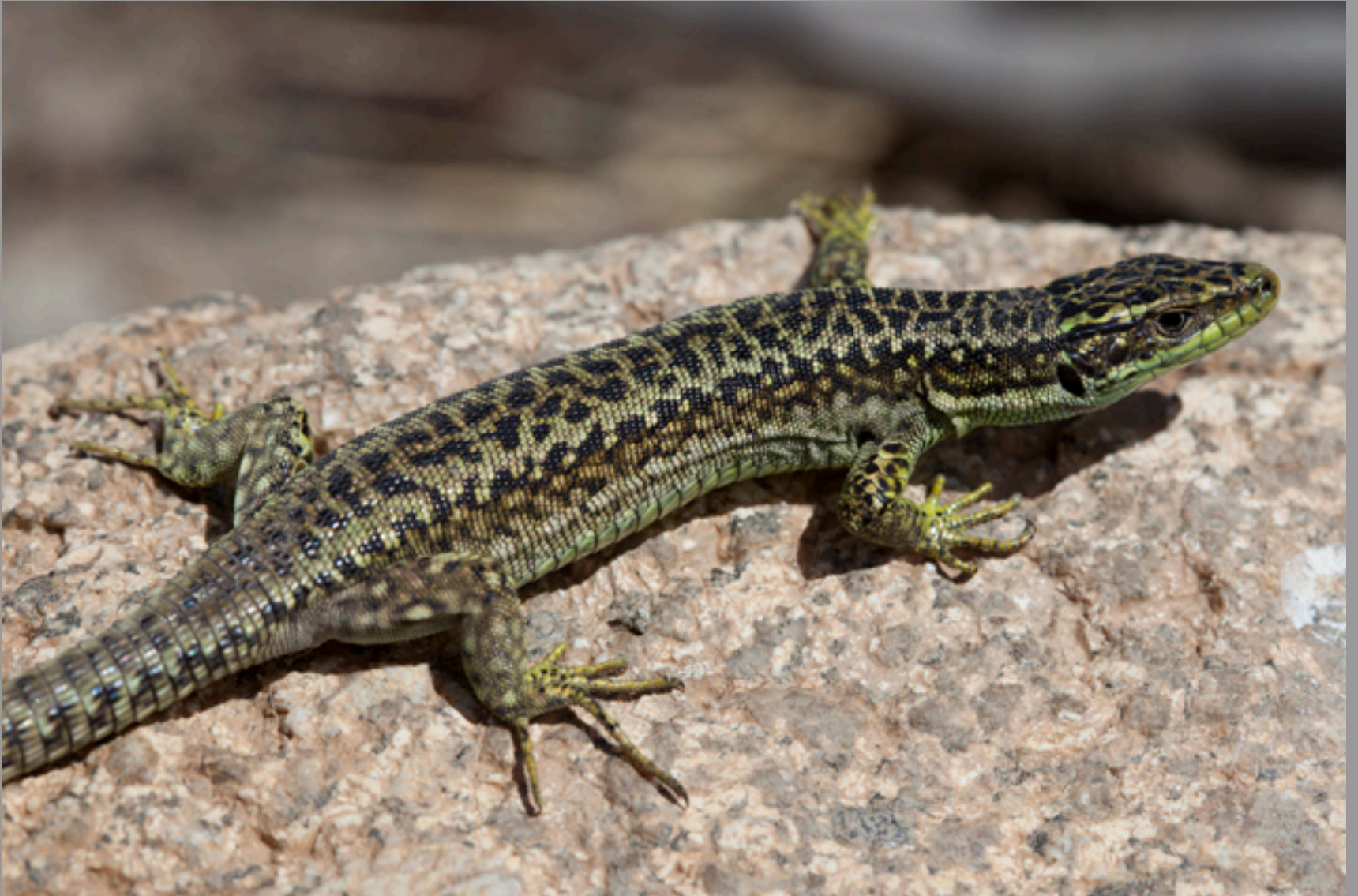
Iberolacerta cyreni castiliana

Once again (!), no Vipera latastei there, but it isn't a surprise ! Other species : Natrix maura , Mauremys leprosa (lowland), Pelophylax perezi , Rana iberica , Lacerta schreiberi .