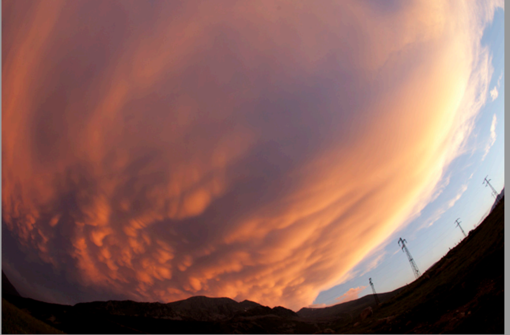
... the beautiful sky