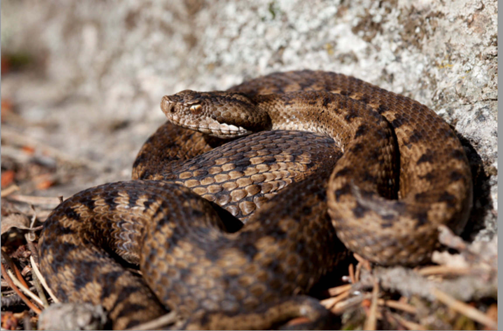
Vipera aspis zinnikeri