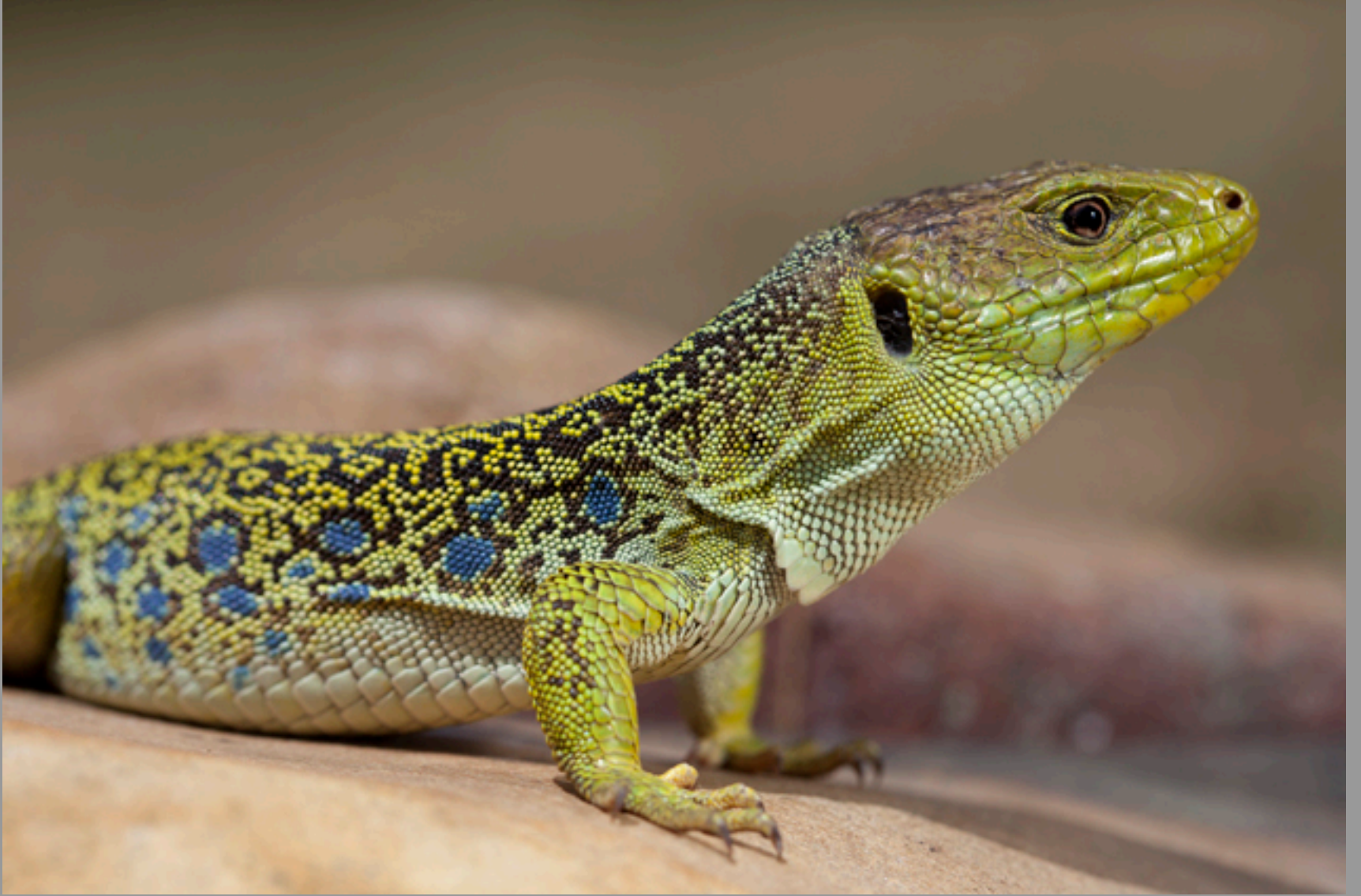
Timon lepidus lepidus , male