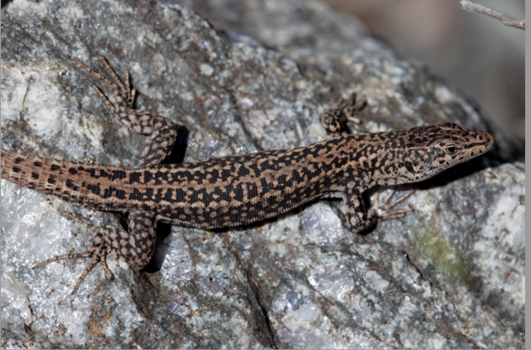
Podarcis guadarramae lusitanicus