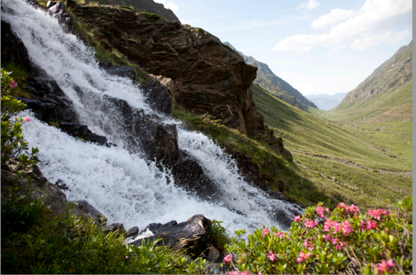
stream near the site