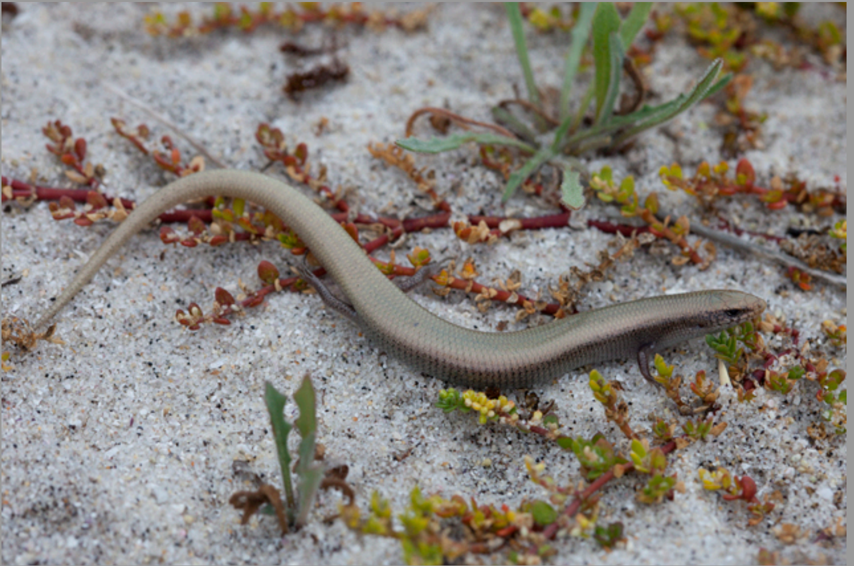
Chalcides bedriagae pistaciae , notice the subtle greenish 'pistachio' reflection

hoping to find Chalcides bedriagae pistaciae . In the late afternoon, I found about x12 of the latter and about x10 Chalcides striatus , adults, gravid females and also very youngs. And under the same rock, x2 Coronella girondica ! Other species : Timon lepidus ibericus , Podarcis bocagei and Anguis fragilis .