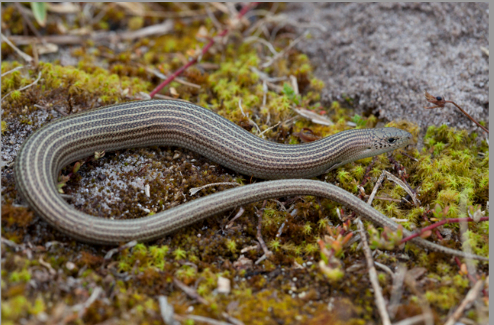
a very beautiful Chalcides striatus