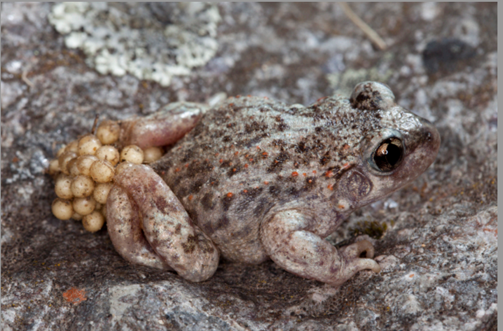
Alytes obstetricans boscai