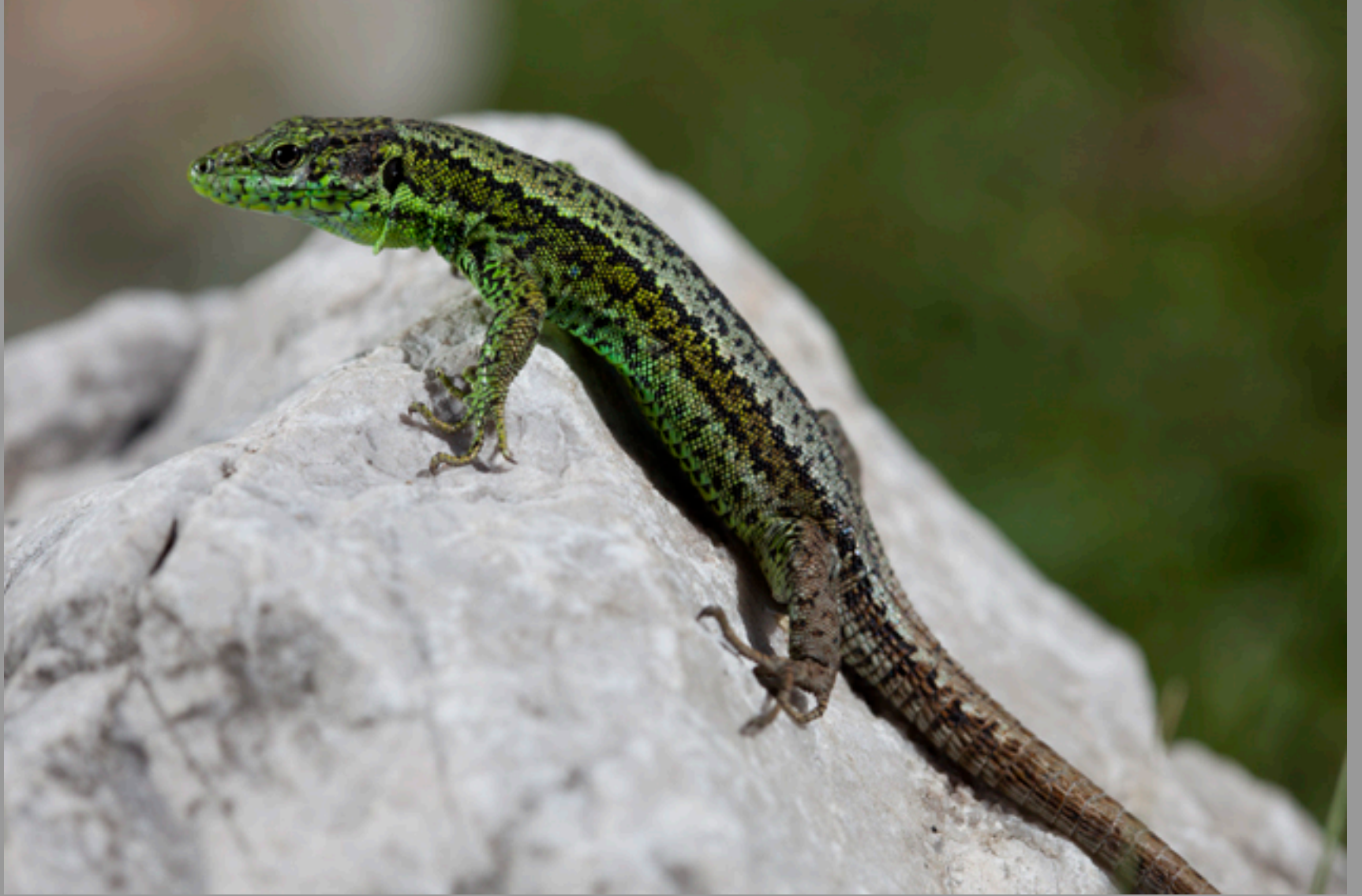
Iberolacerta monticola cantabrica