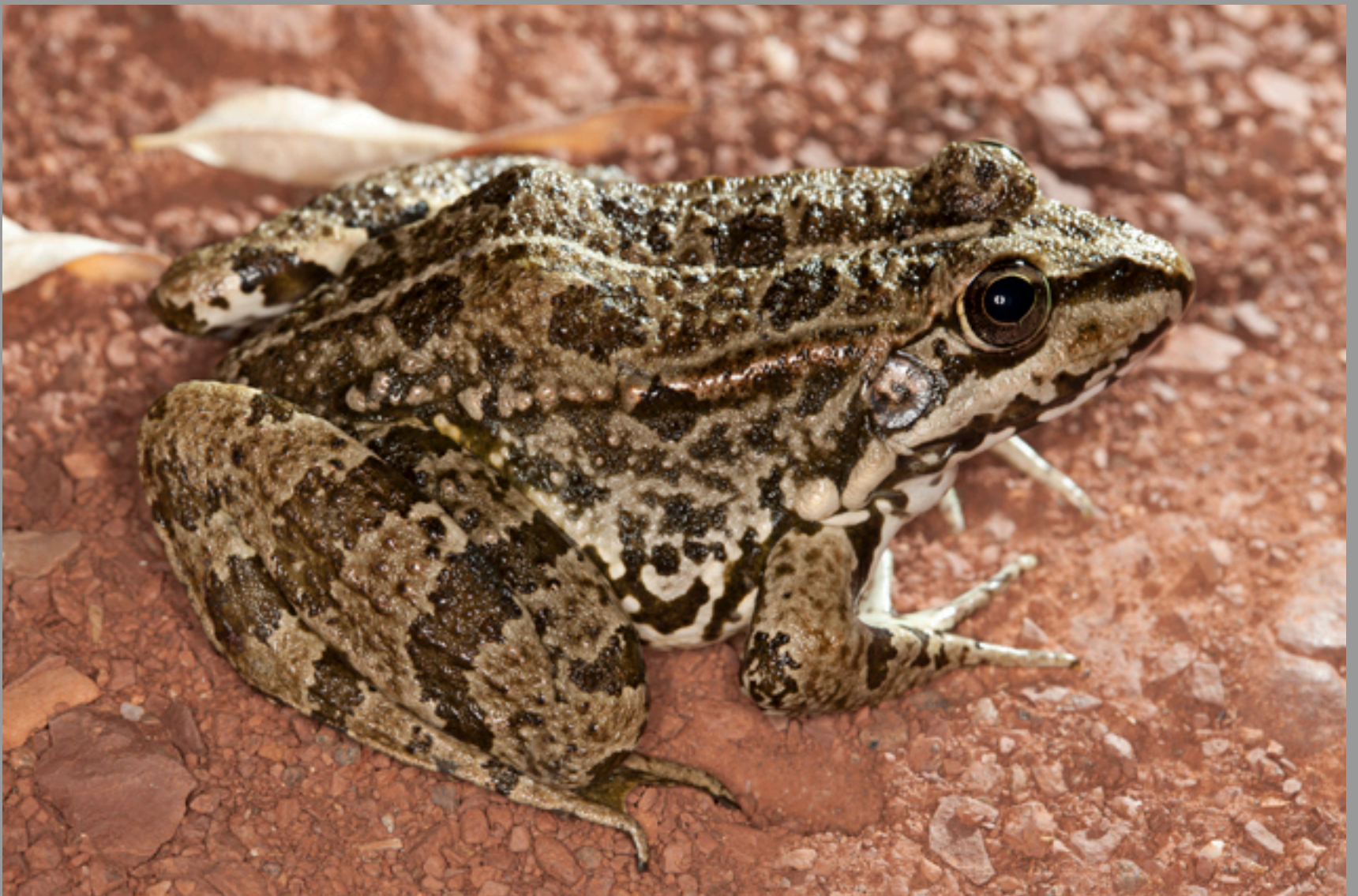
Pelophylax kl. grafi (?)