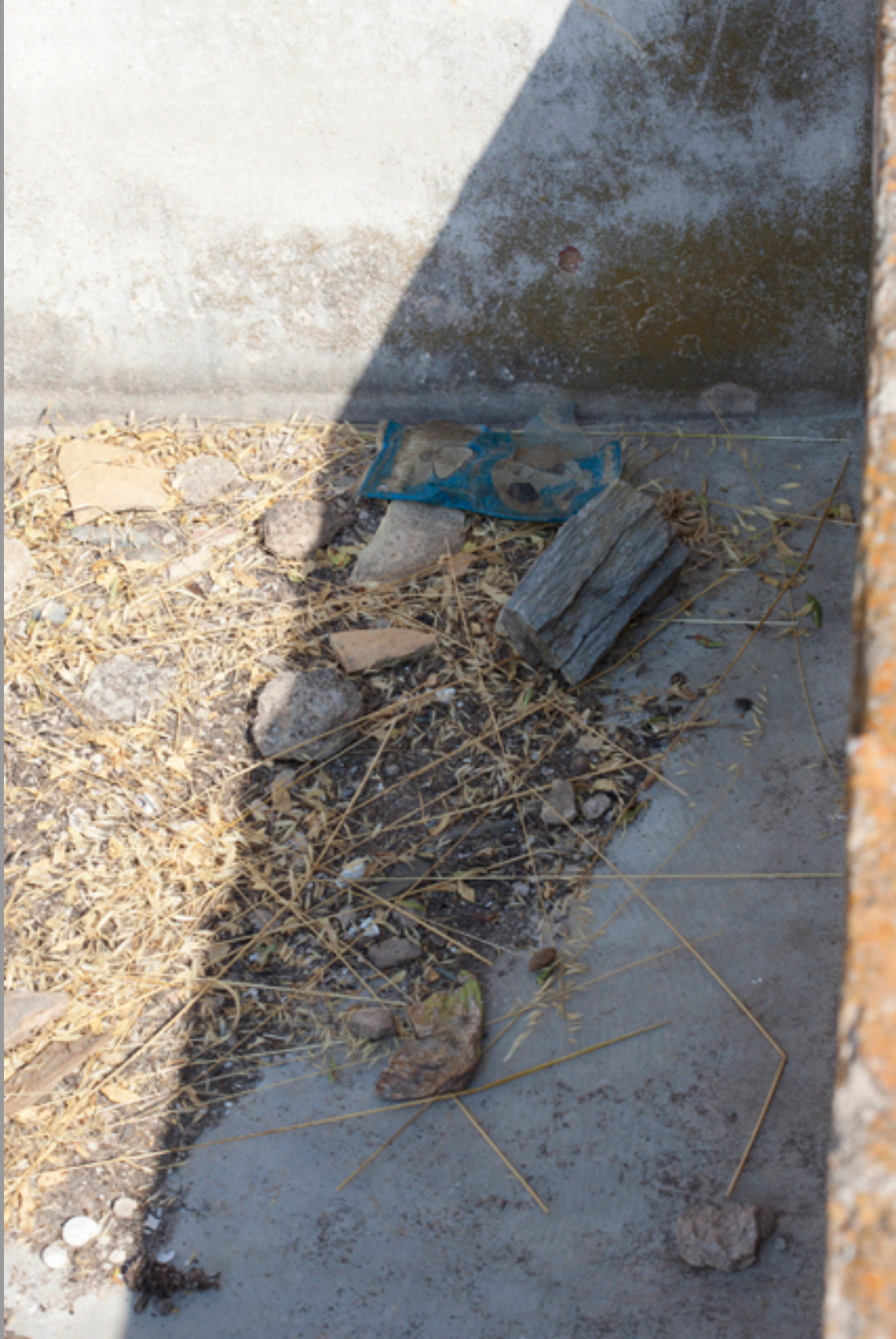
... under the blue bag