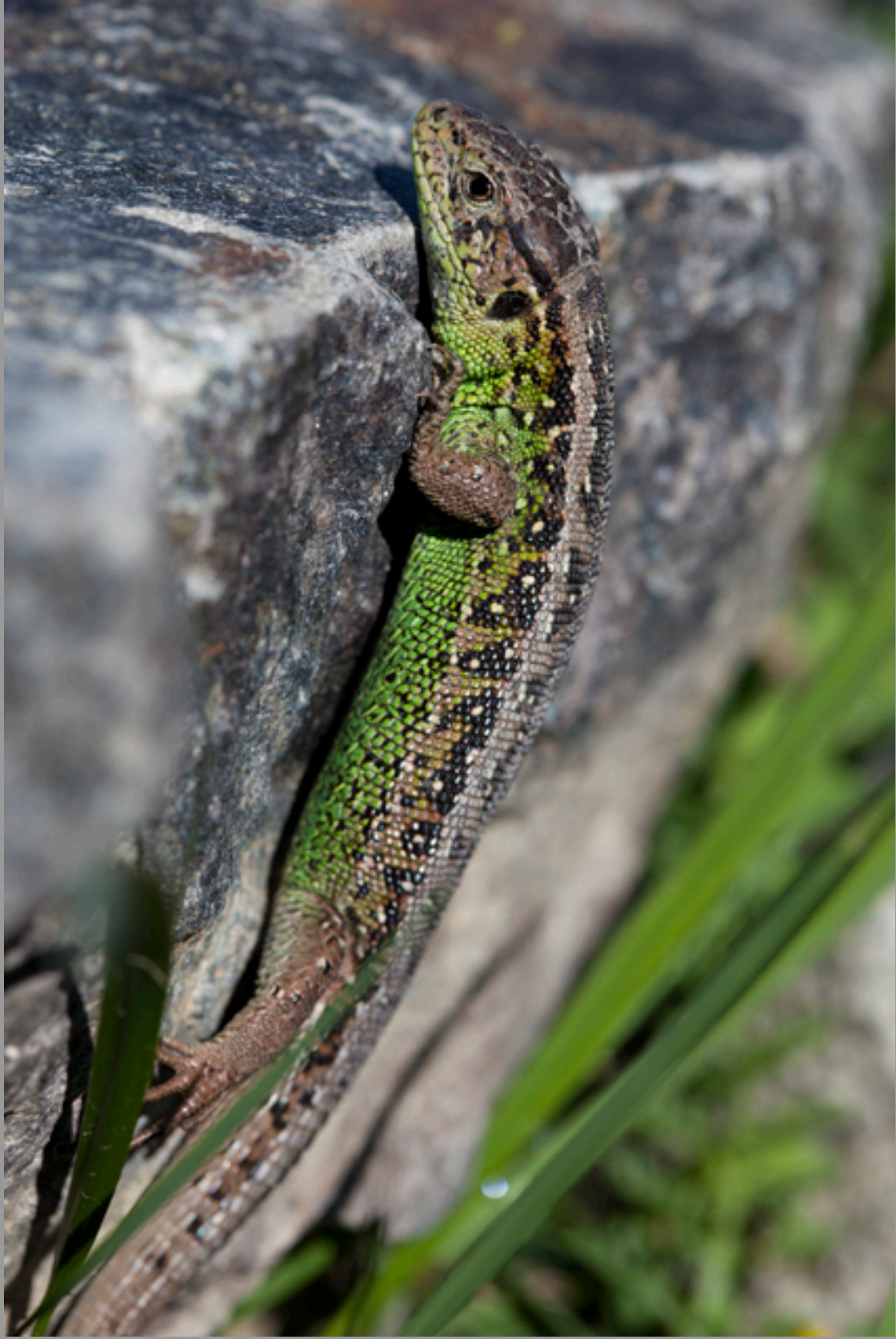
Lacerta agilis garzoni , male