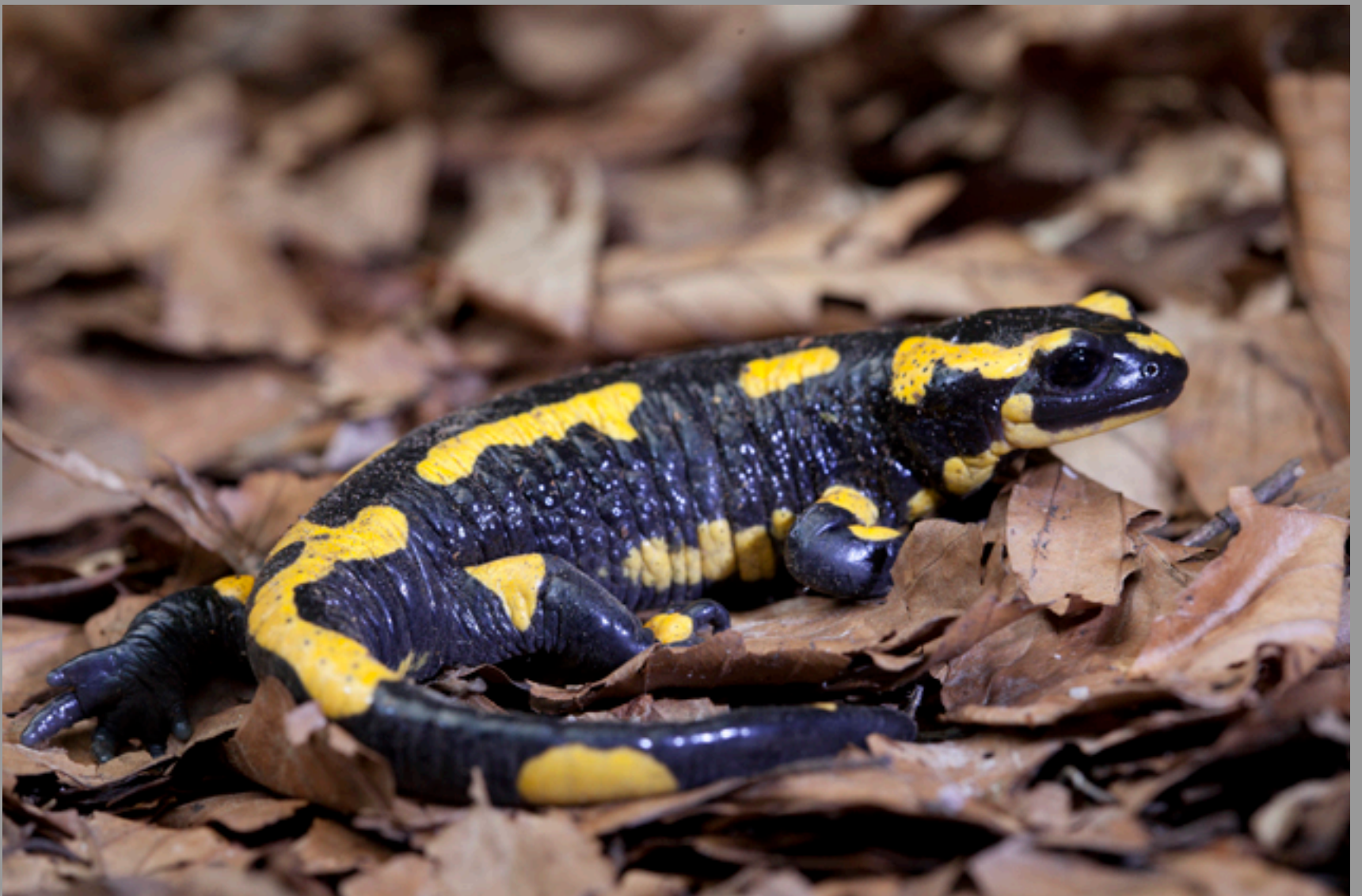
Salamandra salamandra terrestris