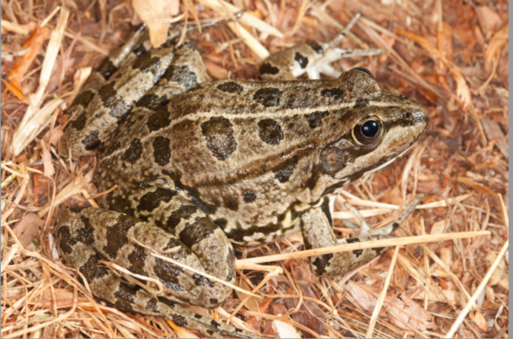
Pelophylax kl. grafi (?)